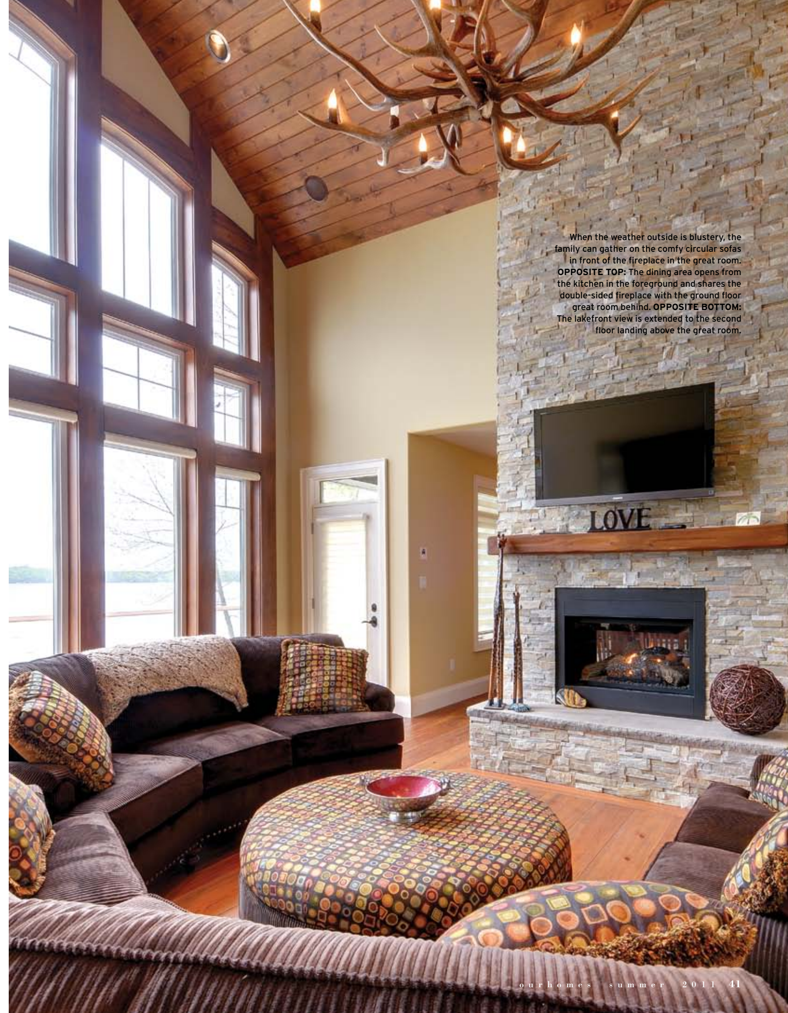
When the weather outside is blustery, the family can gather on the comfy circular sofas in front of the fireplace in the great room. OPPOSITE TOP: The dining area opens from the kitchen in the foreground and shares the double-sided fireplace with the ground floor great room behind. OPPOSITE BOTTOM: The lakefront view is extended to the second floor landing above the great room.