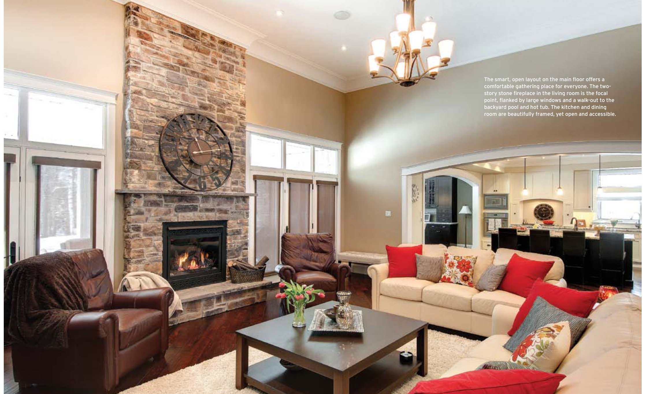
The smart, open layout on the main floor offers a comfortable gathering place for everyone. The two-story stone fireplace in the living room is the focal point, flanked by large windows and a walk-out to the backyard pool and hot tub. The kitchen and dining room are beautifully framed, yet open and accessible.

Having grown up in Barrie, Paul and Nicole Dube knew it was a fine city to raise their own family but as their two daughters, Stephanie and Victoria, approached the teen years they considered a move from their long-time south-end home to an idyllic forested retreat on the north side.