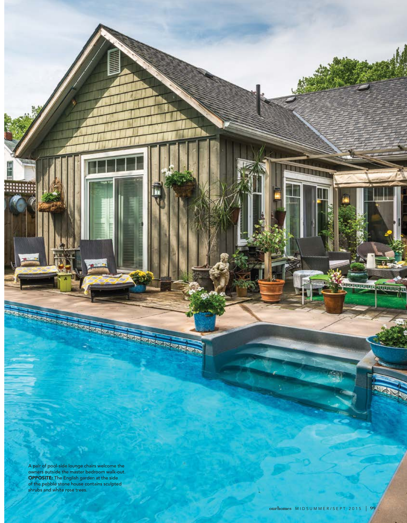
A pair of pool-side lounge chairs welcome the owners outside the master bedroom walk-out. OPPOSITE: The English garden at the side of the pebble stone house contains sculpted shrubs and white rose trees.