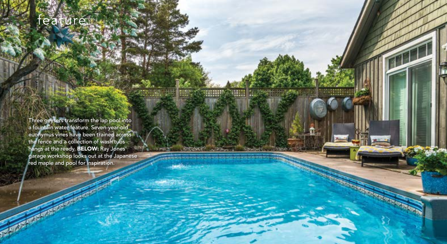
Three geysers transform the lap pool into a fountain water feature. Seven-year-old euonymus vines have been trained across the fence and a collection of wash tubs hangs at the ready. BELOW: Ray Jones' garage workshop looks out at the Japanese red maple and pool for inspiration.