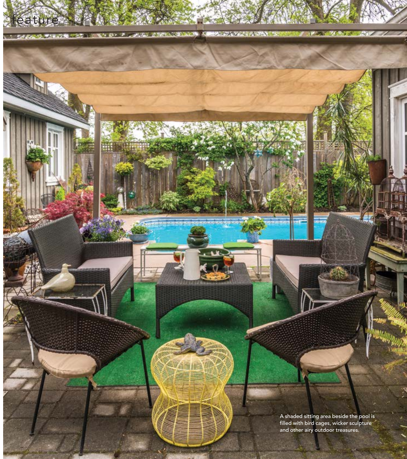
A shaded sitting area beside the pool is filled with bird cages, wicker sculpture and other airy outdoor treasures.

The couple's love of nature and the outdoors is evident everywhere. Through the kitchen down into the rear addition reveals a library and media space with walk-out to the patio and pool area. Broad sliding doors extend the space indoors and out. Windows and doors were supplied by Cedarport Window and Door Centre Inc. Evenings are often spent in this room, ideal for reading, TV watching or