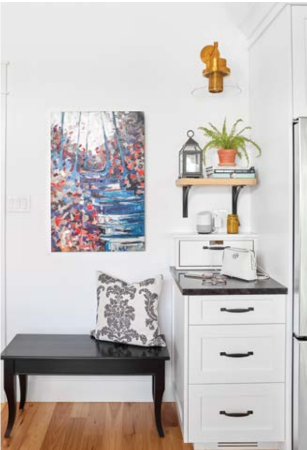
ABOVE: Removing cabinets made way for a knock-out feature wall. RIGHT: The charging station adds function, ideally situated as the family comes into the kitchen, tucking things neatly out of sight.

A harvest table sourced by Mary Cath from Zoey’s Consignment was refinished by House&Canvas . A shelving unit, desk chair and lounge chair from In House complete the space.