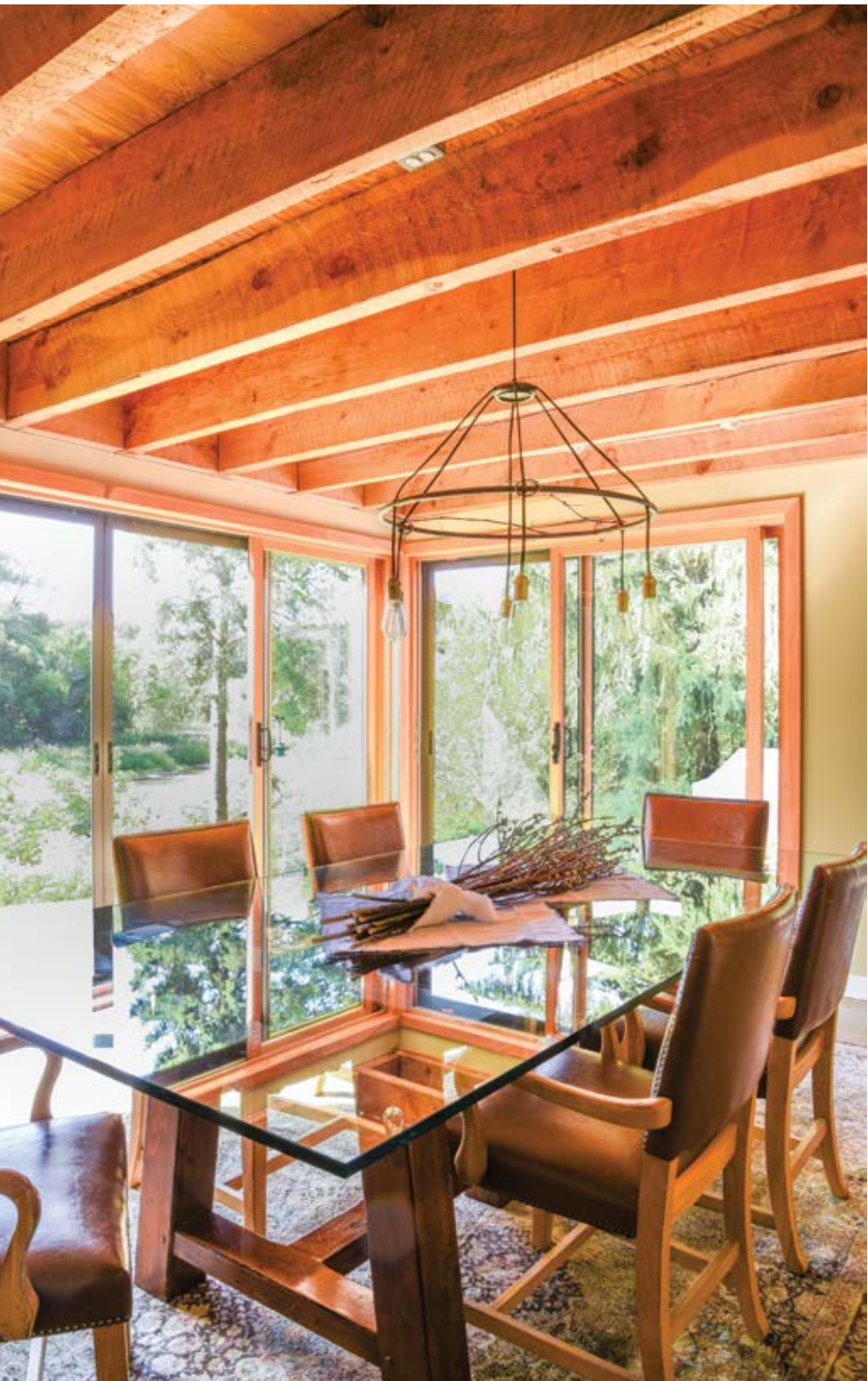
ABOVE: Wall-to-wall sliding doors create a solarium-style retreat for dining. ABOVE RIGHT: The flow of the home maximizes the energetic sightlines. OPPOSITE, TOP LEFT: A lack of window treatments allow for unencumbered views. TOP RIGHT: Cosy yet functional furnishings welcome relaxation. BOTTOM LEFT: The resort-like setting is a wonderful backdrop for entertaining or relaxing. BOTTOM RIGHT: Rough-hewn Douglas fir beams add warmth and dimension.