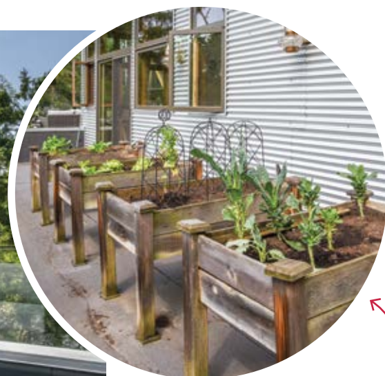
Raised planter beds are both beautiful and functional.