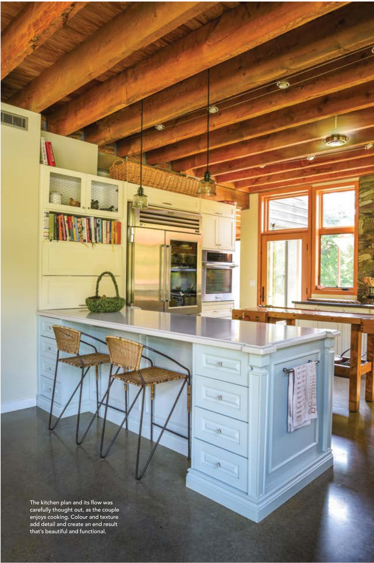
The kitchen plan and its flow was carefully thought out, as the couple enjoys cooking. Colour and texture add detail and create an end result that's beautiful and functional.