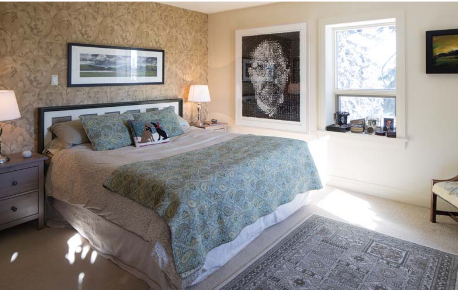
ABOVE: Ion's bedroom is situated across the hall from his dream bathroom. RIGHT: This delicate chair sits in the corner of Ion's bedroom surrounded by art.

One of the reasons Ion enthusiastically jumps out of bed every morning likely has to do with the spa-meets-country bathroom, with its vast glass-shower door, wide barn-board interior ceramic tile, and giant waterfall showerhead. "I wake up every day with a smile on my face knowing I get to shower in here," he says. A skylight gives the room an exceptional open-air natural beauty.