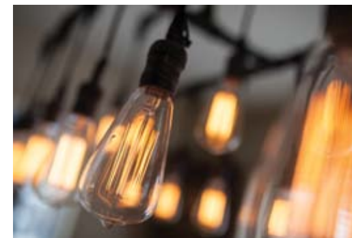
TOP: The dining area, with a 50-year-old family harvest table, is just off the kitchen. The old grandfather clock that Ion’s parents brought over from Dublin sits in the corner. ABOVE: The unique lighting is made of repurposed household pipe and painted stark black from Architectural Antique Lighting.

With his dog, Towser, and sons; Parker, 15 and Ryan, 20, Ion knew he needed flooring that could take a lot of wear, so he opted for a durable wide-plank country-inspired laminate from Orleans Carpet . Its rich colour grounds the room and provides smart and attractive functionality.