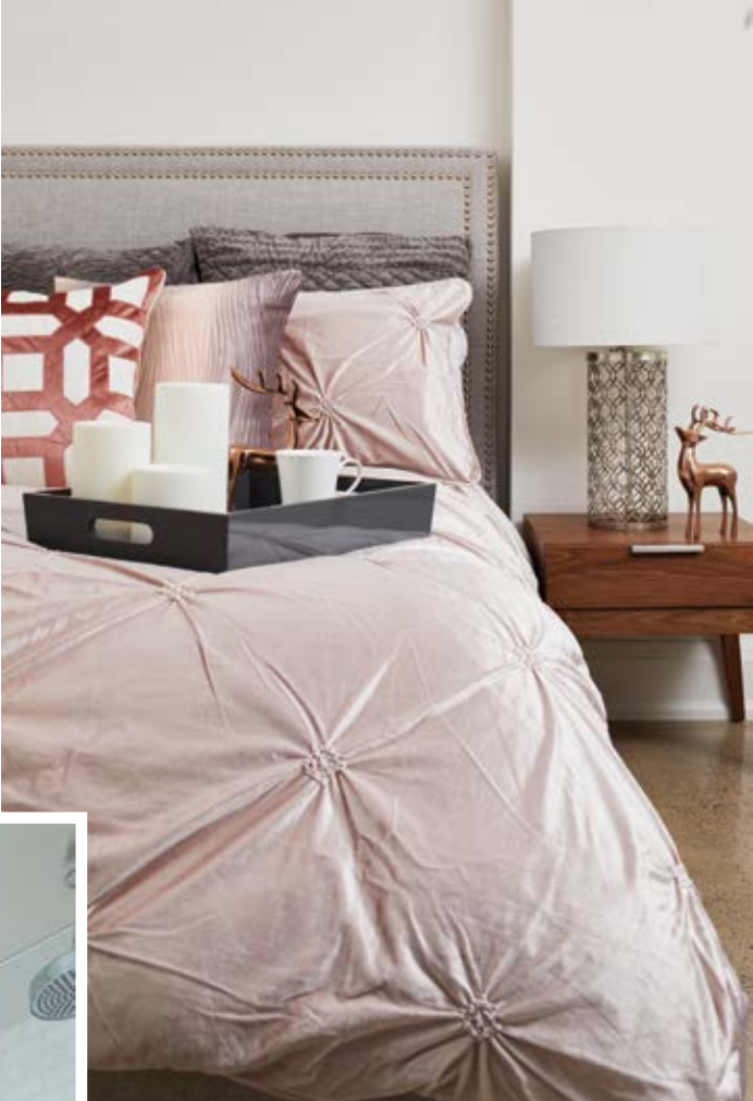
BELOW: Pretty pink accents help deck the halls in style in the en suite. RIGHT: The master bedroom is a vision of love with soft, romantic hues. BOTTOM RIGHT: The home is well-appointed, with finishes like oversize doors, hexagon tiles and a floating vanity in this bathroom.

Lighting goes funky with a globe starburst that lights both the living and dining rooms. A graphic black and white area rug from Minster Interiors Inc. in the living room gives the space another funky pop. Interestingly, the art was purchased from Etsy. “It was commissioned, so Samantha got to choose the colours she wanted in them and it was made for her. She pulled in the electric blue and some green and some purple,” says Barbosa. “I wanted comfort and a modern/contemporary space,” says Barone. “It all turned out better than expected – different than what I pictured, but in a good way.” OH