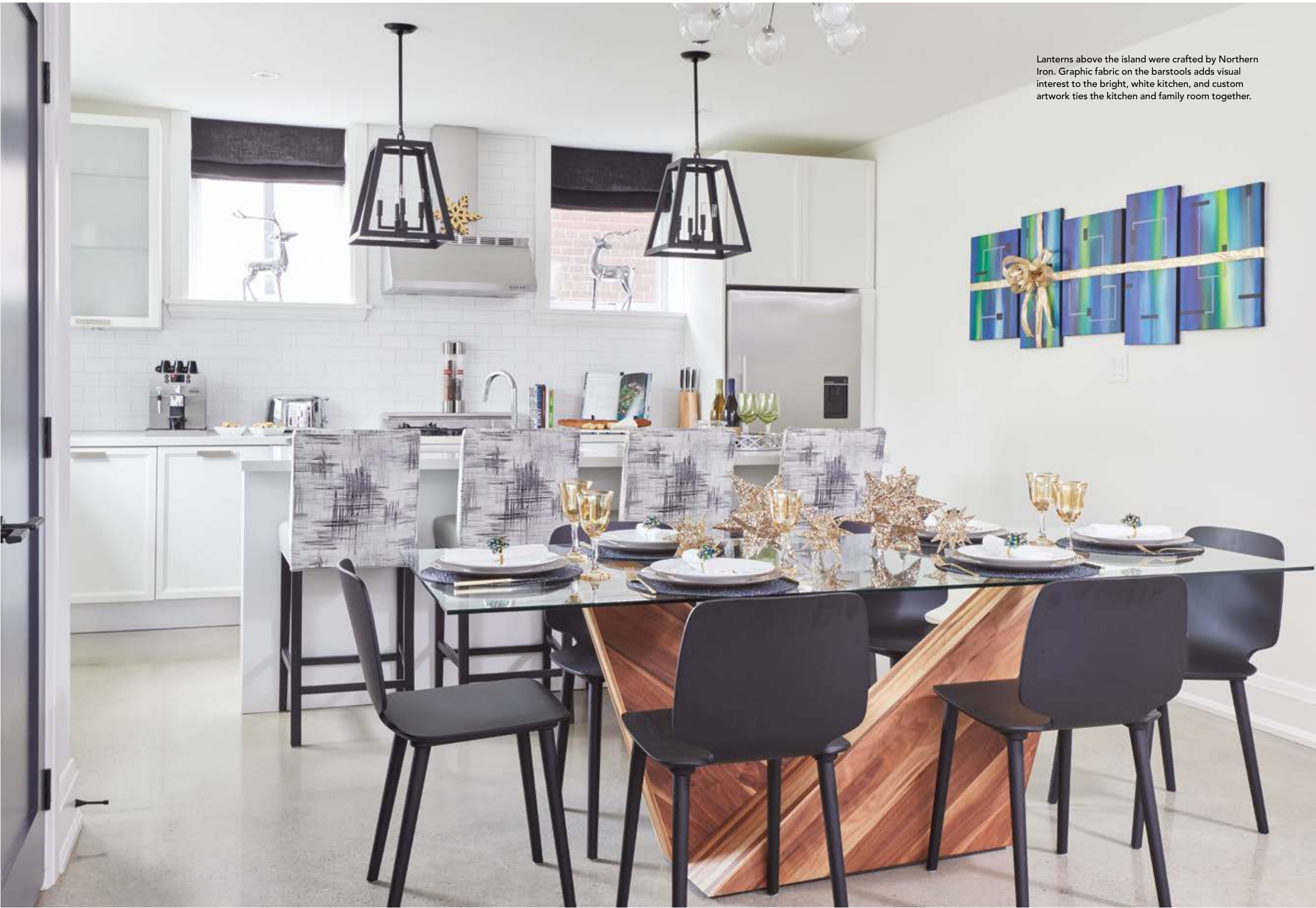
Lanterns above the island were crafted by Northern Iron. Graphic fabric on the barstools adds visual interest to the bright, white kitchen, and custom artwork ties the kitchen and family room together.

“I’M VERY MUCH ABOUT SUPPORTING LOCALLY MADE, CANADIAN PIECES – I REALLY BELIEVE IN THAT. IT’S SOMETHING I HAVE A PASSION FOR.”