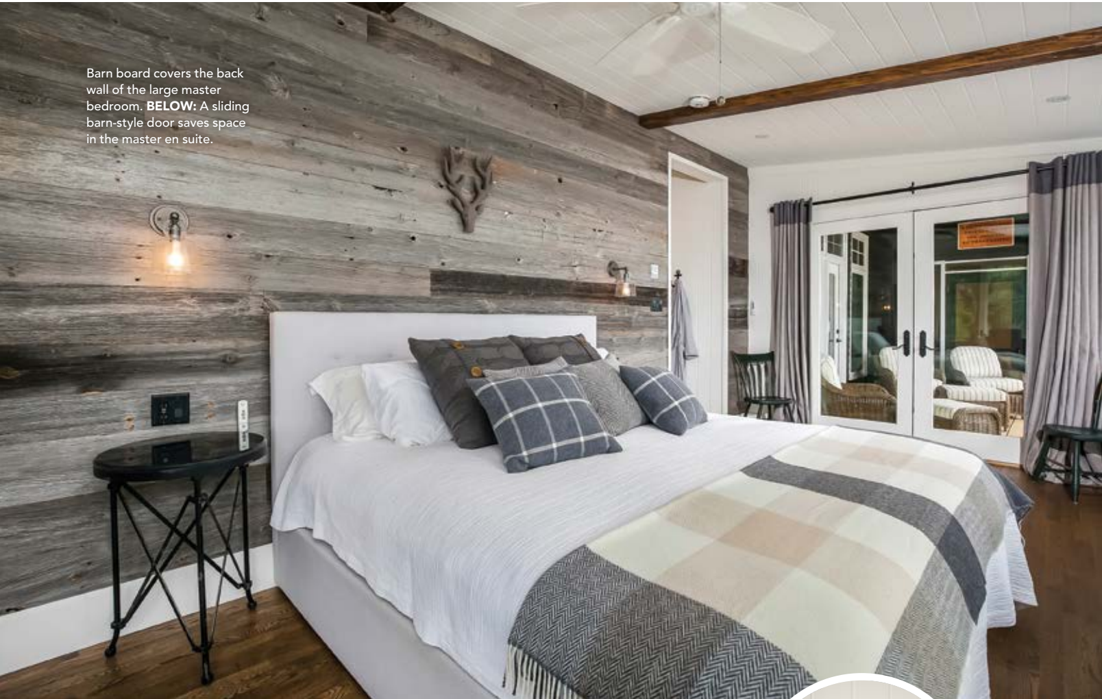
Barn board covers the back wall of the large master bedroom. BELOW: A sliding barn-style door saves space in the master en suite.

Wendy collaborated with Lena to design the clean, modern kitchen with Caesarstone quartz countertops, glass cabinet doors and an adjacent dining space with a custom-built, live-edge dinner table. “I am big into cooking and baking,” says Wendy. “For us it’s all about a practical layout in a way that allows people to be with us as we’re cooking and enjoying being at the cottage.” Brown’s Appliances equipped the new kitchen with KitchenAid appliances and an induction cooktop. Stoneway Marble & Granite Inc. supplied stone countertops.