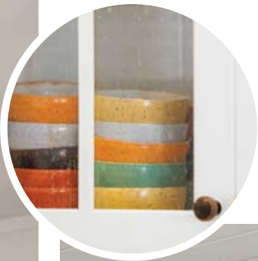
Glass doors showcase colourful dinnerware.