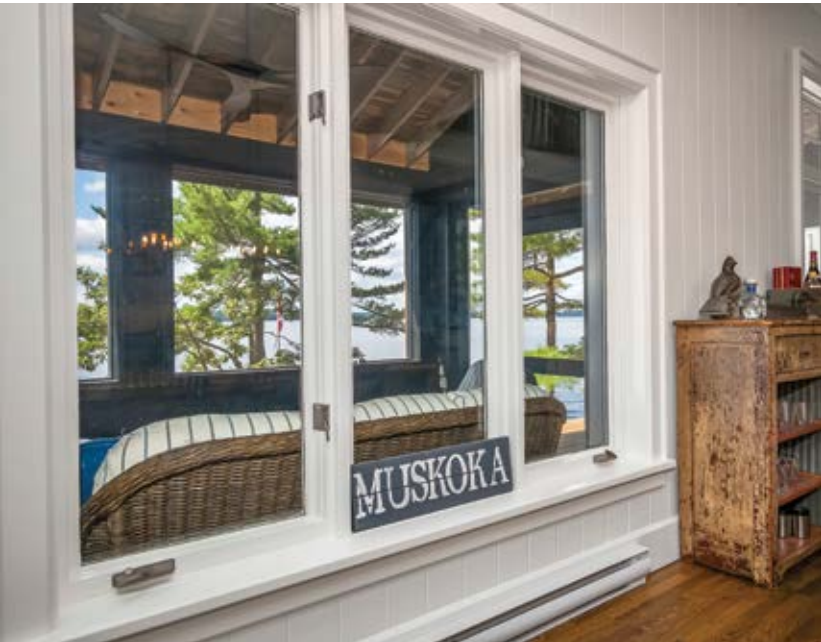
LEFT: Light wicker and striped cushions contrast nicely with the dark walls of the Muskoka room in this Lake Joseph cottage. BELOW: Muskoka Window and Door Centre supplied new windows throughout the renovation. BOTTOM: Coulson Bros. Scow Service built the large stone patio in the front yard.