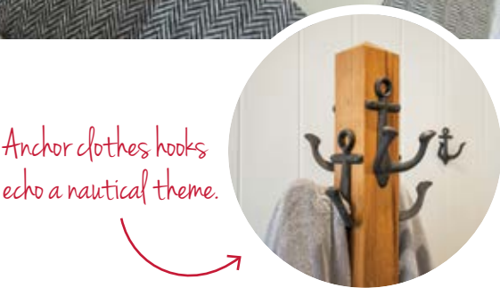
Anchor clothes hooks echo a nautical theme.