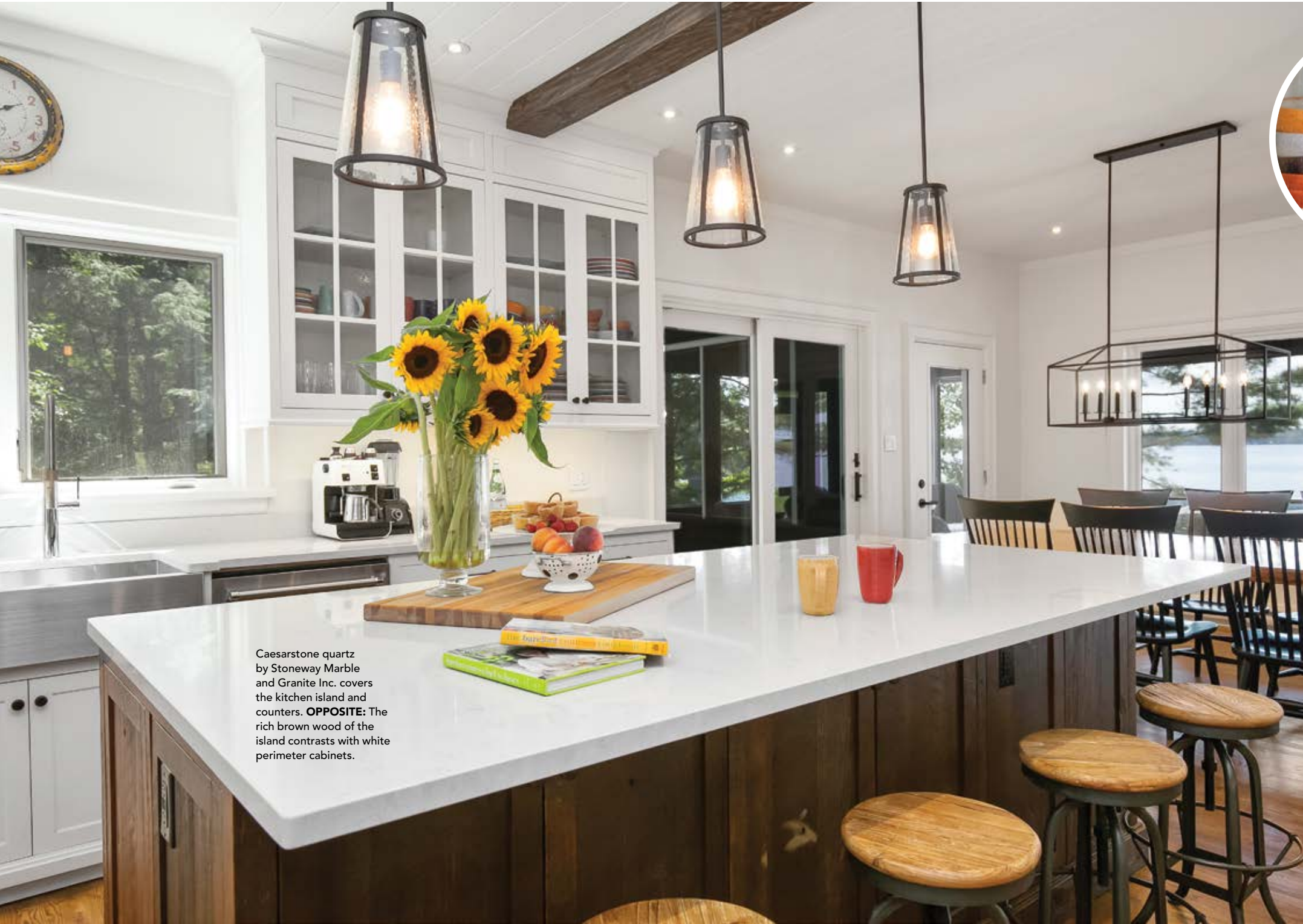
Caesarstone quartz by Stoneway Marble and Granite Inc. covers the kitchen island and counters. OPPOSITE: The rich brown wood of the island contrasts with white perimeter cabinets.