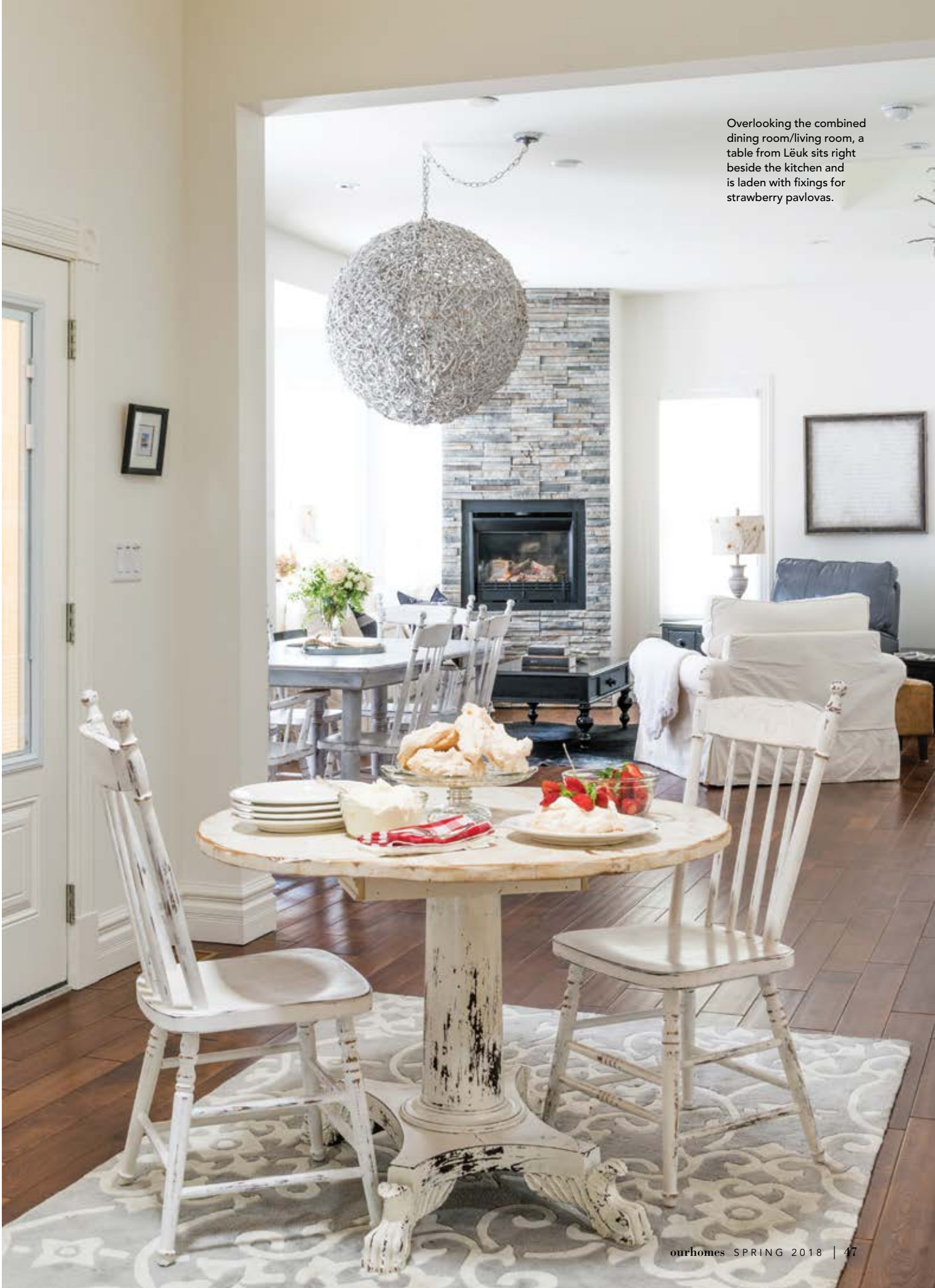
Overlooking the combined dining room/living room, a table from Lëuk sits right beside the kitchen and is laden with fixings for strawberry pavlovas.