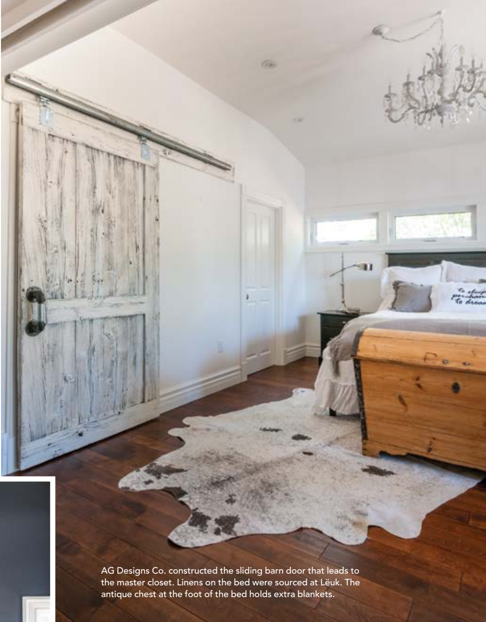
AG Designs Co. constructed the sliding barn door that leads to the master closet. Linens on the bed were sourced at Lëuk. The antique chest at the foot of the bed holds extra blankets.

BELOW: The master en suite has a large, glass-enclosed shower and soaker tub. The driftwood wall art brings thoughts of the sea into the room.