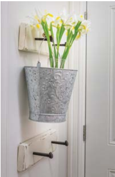
LEFT: In the mudroom, near the door to the garage, hooks are at the ready for coats or beautiful flowers. FAR LEFT: In a guest bedroom, a crystal chandelier sparkles over the inviting bed. A vintage ladder from Kettlewells holds towels. BELOW: Peeking into the mudroom, lots of storage holds all the gear the Moores require and it offers a spot to catch up on paperwork.