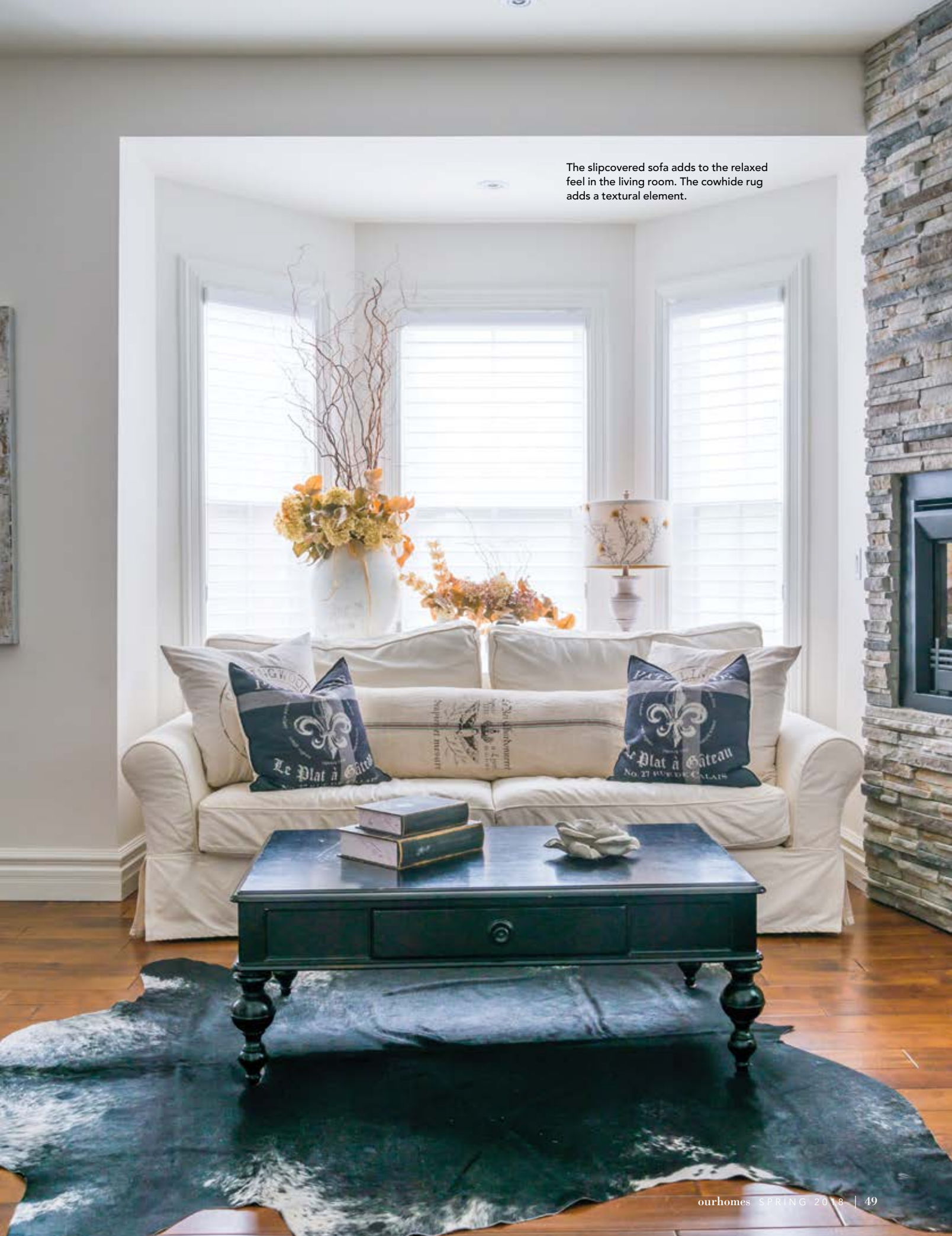
The slipcovered sofa adds to the relaxed feel in the living room. The cowhide rug adds a textural element.