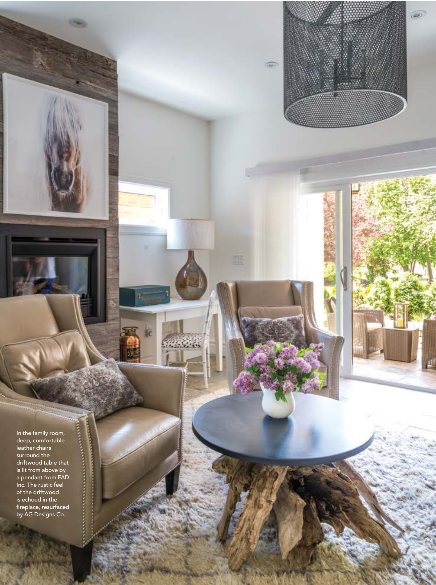
In the family room, deep, comfortable leather chairs surround the driftwood table that is lit from above by a pendant from FAD Inc. The rustic feel of the driftwood is echoed in the fireplace, resurfaced by AG Designs Co.