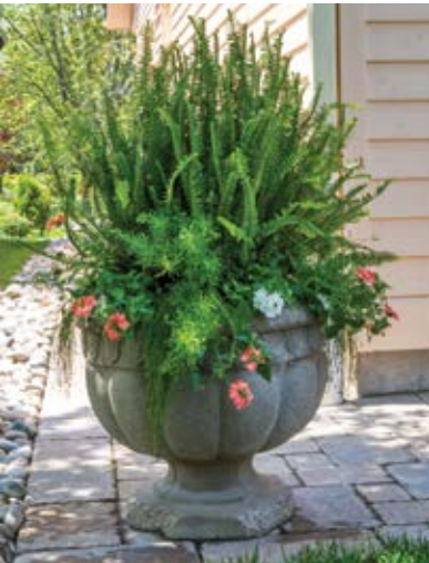
BELOW: One of the many colourful urns placed outside the home – the work of Natural Blends. RIGHT: This quiet, covered spot is located just off the family room, so even in the rain there is somewhere outside to enjoy morning coffee and the view of the park across the road. BOTTOM: Matching loungers in a secluded area at the rear of the house are surrounded by additional containers planted by Natural Blends.