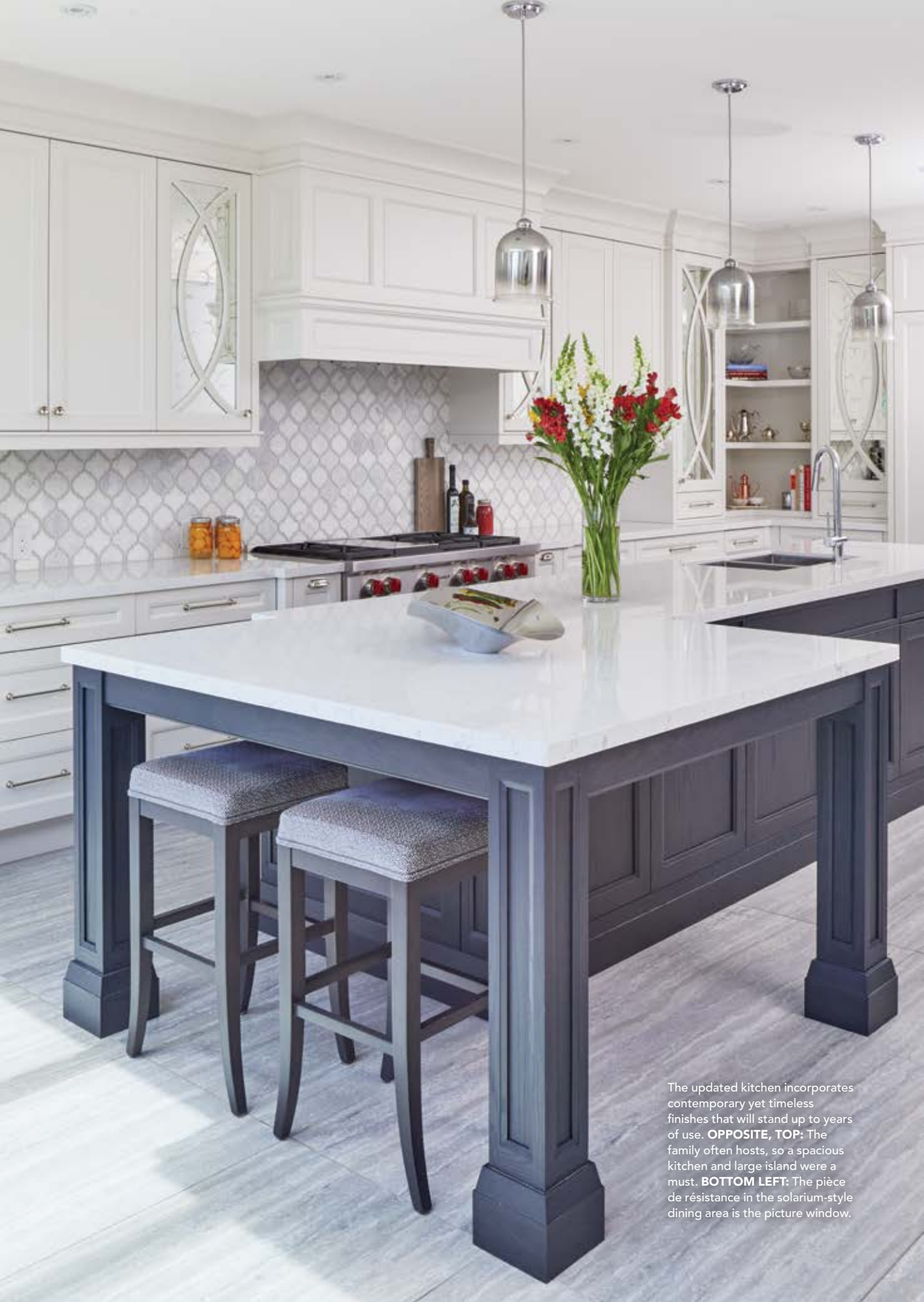
The updated kitchen incorporates contemporary yet timeless finishes that will stand up to years of use. OPPOSITE, TOP: The family often hosts, so a spacious kitchen and large island were a must. BOTTOM LEFT: The pièce de résistance in the solarium-style dining area is the picture window.