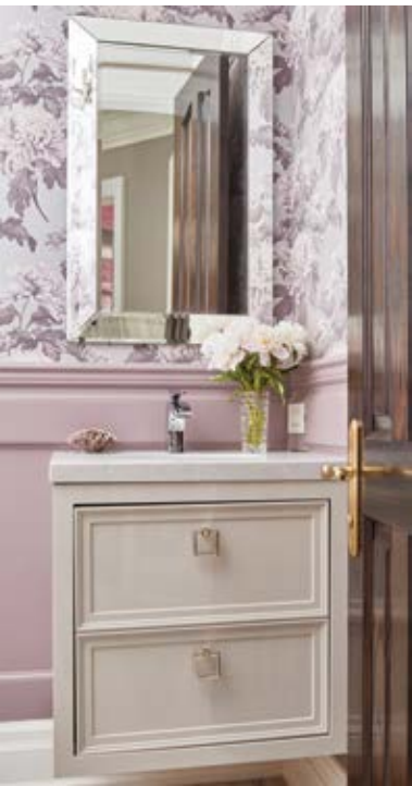
LEFT: Custom integrated cabinetry in the office maximizes the space. BELOW LEFT: Pretty floral wallpaper adds a playful touch to the powder room. BELOW: The living room is elegant yet still comfortable enough to linger in.