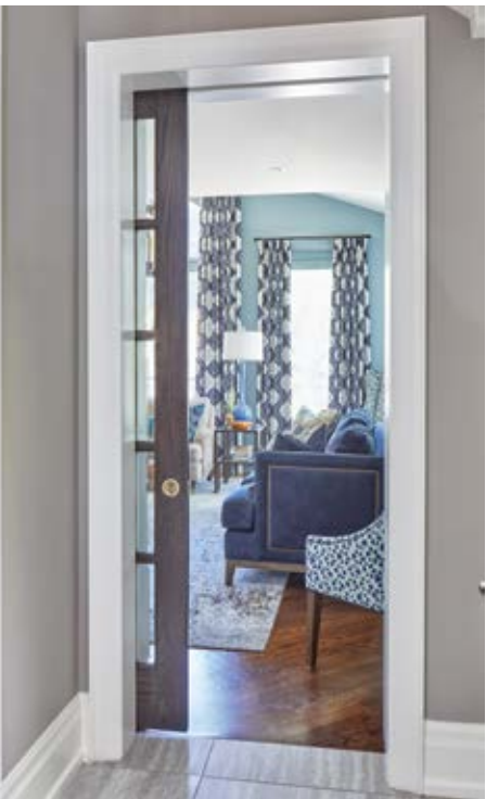
Beautiful blues and warm wood hues create a cosy, casual family room. Just off the kitchen, it's the perfect location for extending space when hosting larger groups.