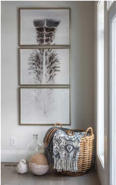
ABOVE: A feathery triptych floats in a quiet corner of the cottage. RIGHT: Northern Living Kitchen & Bath designed the new kitchen for easy entertaining. Living Lighting sourced the Curry & Company chandelier over the dinner table.

Clear communication and getting to know each client’s specific needs, tastes and wants begins early in the planning and design process at Northern Living.