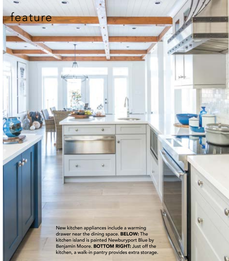
New kitchen appliances include a warming drawer near the dining space. BELOW: The kitchen island is painted Newburyport Blue by Benjamin Moore. BOTTOM RIGHT: Just off the kitchen, a walk-in pantry provides extra storage.