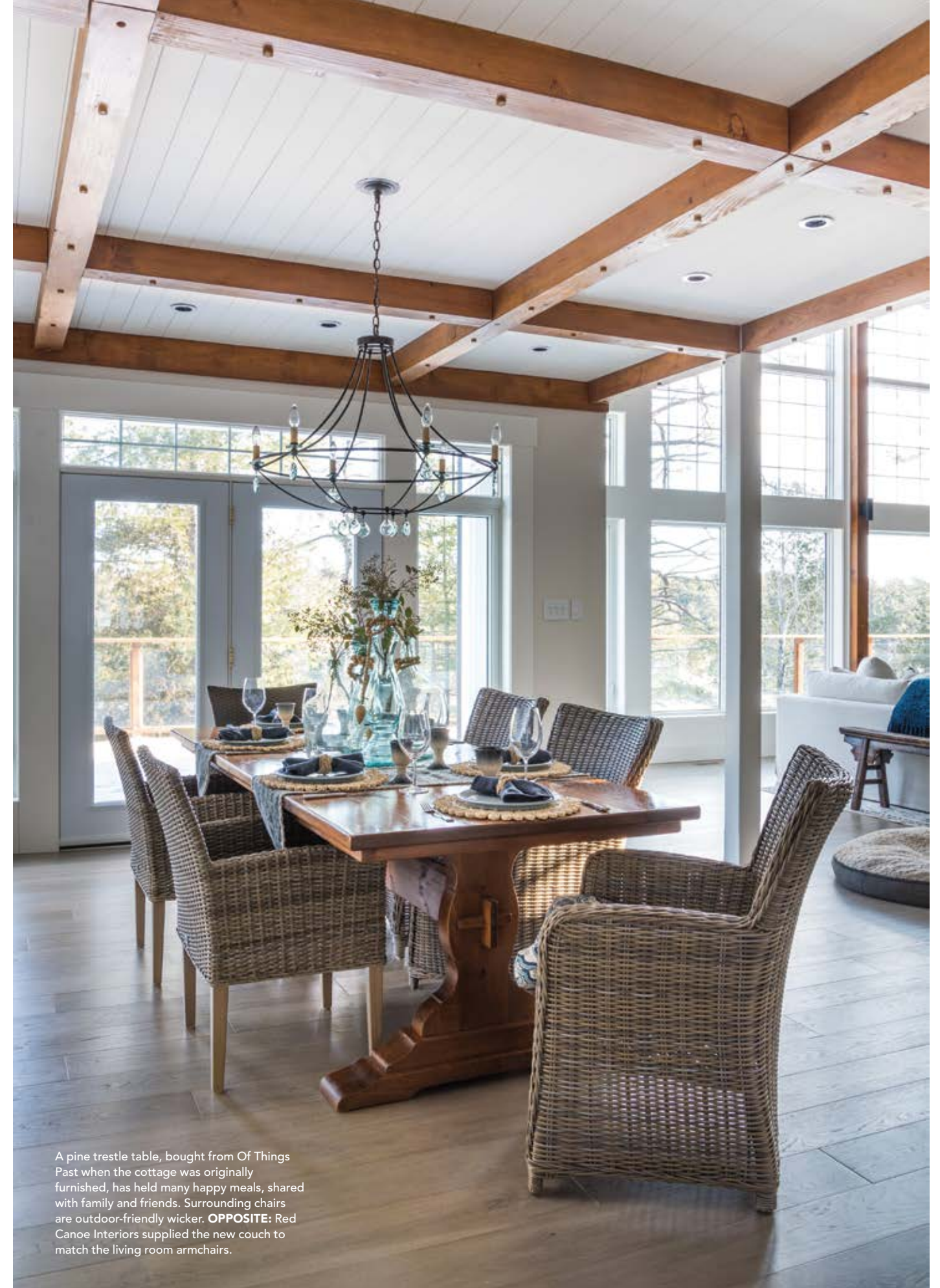
A pine trestle table, bought from Of Things Past when the cottage was originally furnished, has held many happy meals, shared with family and friends. Surrounding chairs are outdoor-friendly wicker. OPPOSITE: Red Canoe Interiors supplied the new couch to match the living room armchairs.