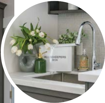
Tulips in a gurgle jug from Red Canoe Interiors nod at the tiny sink in the mudroom.