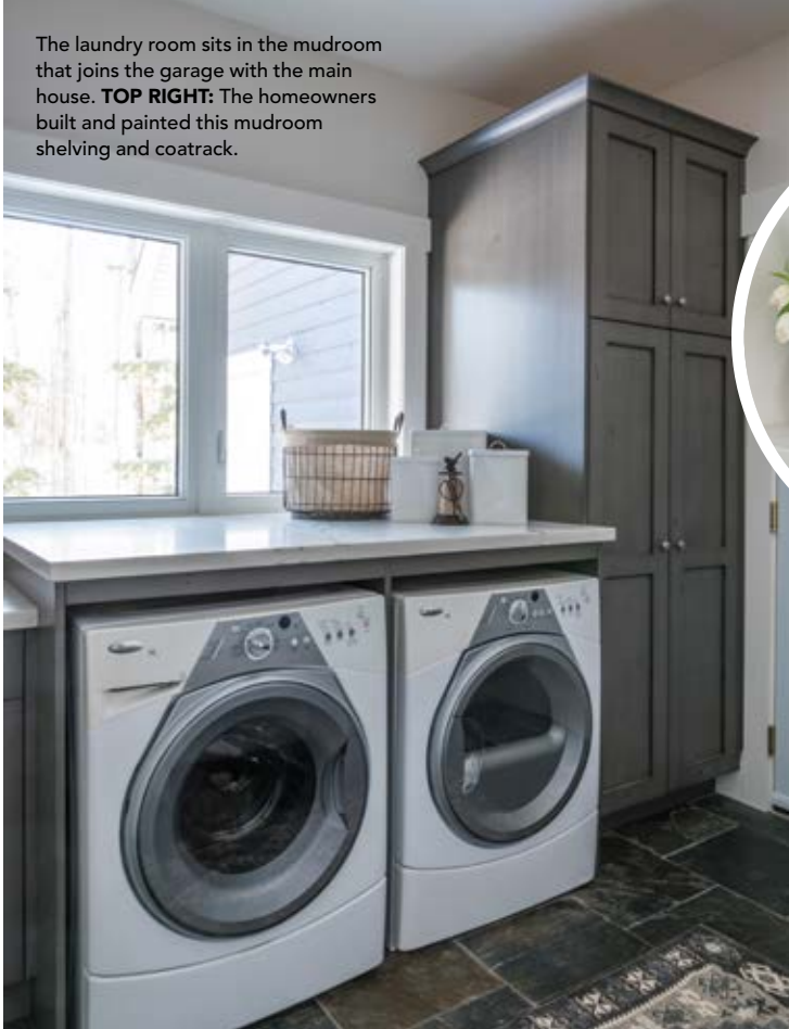
The laundry room sits in the mudroom that joins the garage with the main house. TOP RIGHT: The homeowners built and painted this mudroom shelving and coatrack.