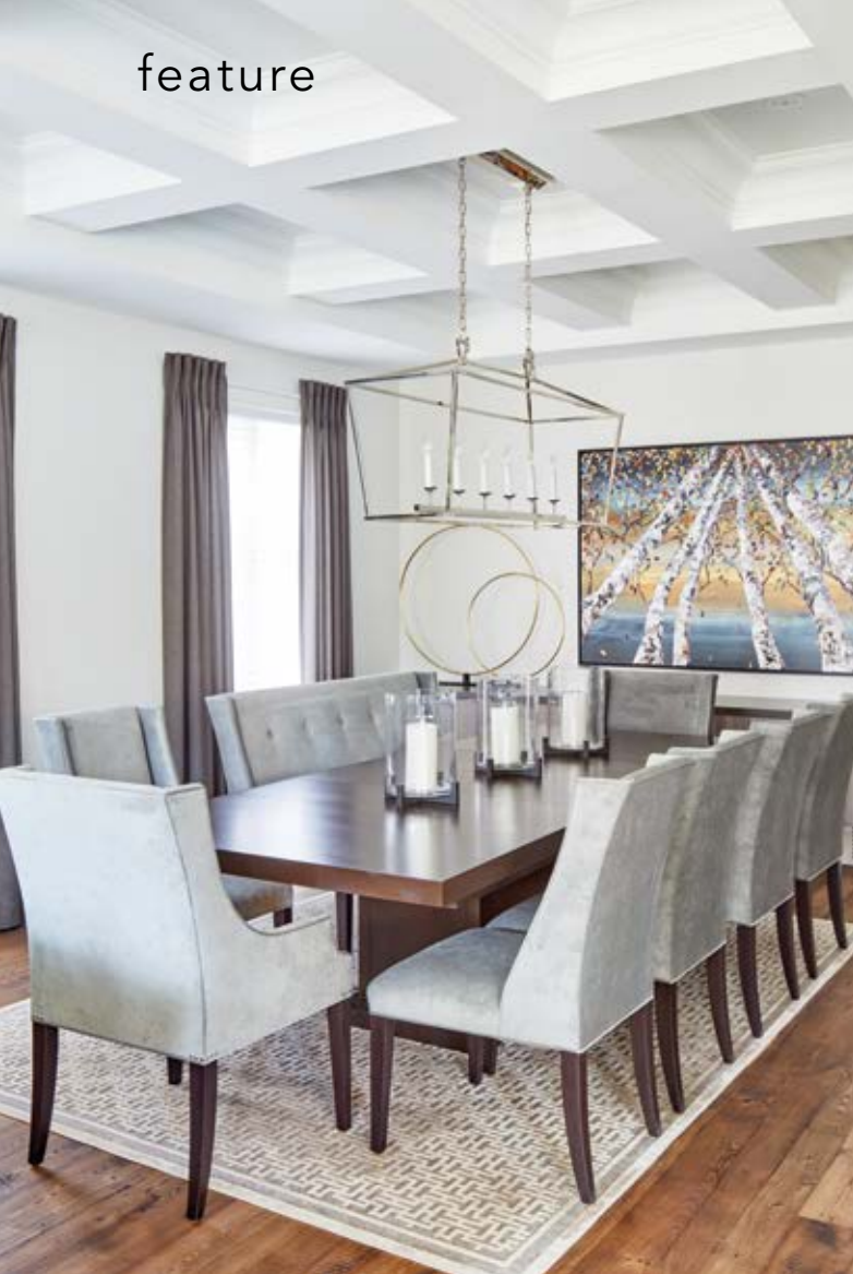
ABOVE: A waffle ceiling adds formality in the dining room. LEFT: A walnut sliding barn door encloses the office space.