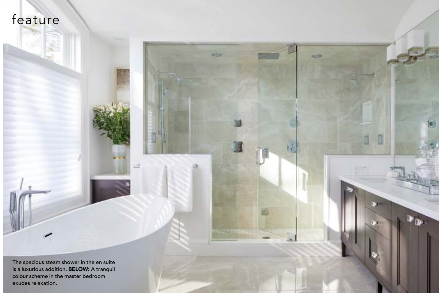
The spacious steam shower in the en suite is a luxurious addition. BELOW: A tranquil colour scheme in the master bedroom exudes relaxation.