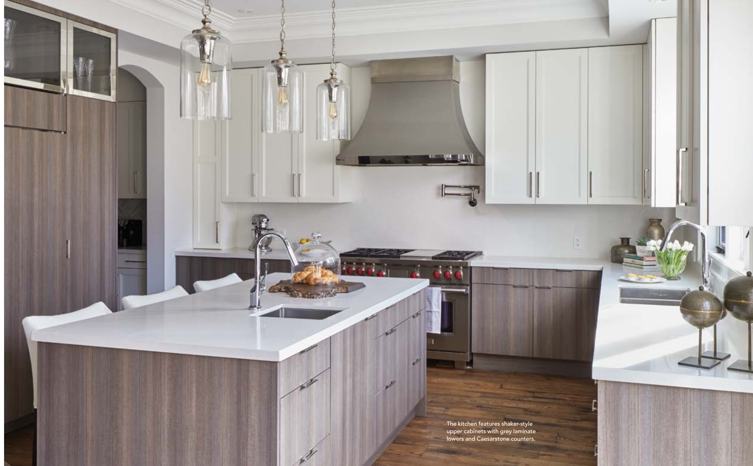
The kitchen features shaker-style upper cabinets with grey laminate lowers and Caesarstone counters.

Flowers add a fresh touch to the elegant home.