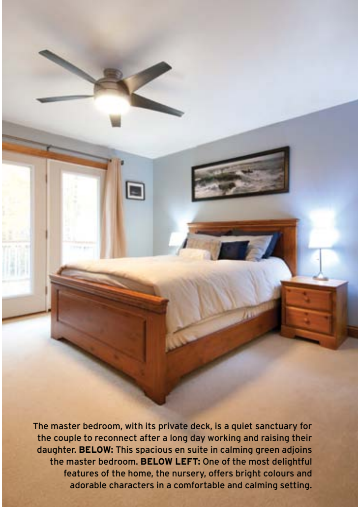
The master bedroom, with its private deck, is a quiet sanctuary for the couple to reconnect after a long day working and raising their daughter. BELOW: This spacious en suite in calming green adjoins the master bedroom. BELOW LEFT: One of the most delightful features of the home, the nursery, offers bright colours and adorable characters in a comfortable and calming setting.