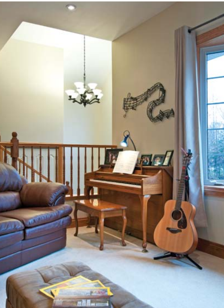
TOP LEFT: The sunken living room showcases the couple's passion for music in a central location for entertaining guests and each other. TOP RIGHT: A solid wood banister separates the kitchen and living space without sacrificing the open concept design of the home. RIGHT: The kitchen island is equipped with a sizable overhang to accommodate extra guests during parties and also works as a breakfast and snacking area.