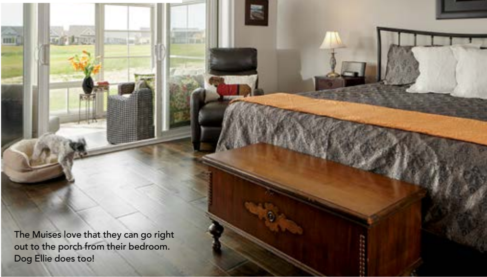
The Muises love that they can go right out to the porch from their bedroom. Dog Ellie does too!

swimming pool with doors that open to an amazing patio, a hot tub, saunas, a gym facility, and world-class pickleball courts. And for those looking for entertainment, there will be a movie theatre, card rooms and billiards. Whether you prefer to dine with friends and family at David’s Restaurant, or to meet neighbours for cocktails at The Double Olive Lounge, you’ll find no shortage of things to do within walking distance. Take a stroll through wooded walking trails or bring your furry friend to the leash-free dog run. Soak up the sun at the lakeside infinity deck and swim dock. And when it’s time to relax, Elements Day Spa will pamper you. Continued on page 49