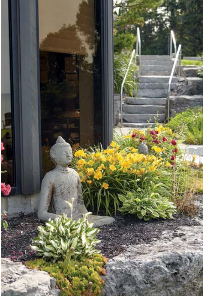
LEFT: Residents of Dover Coast can take advantage of numerous community amenities, including manicured gardens and a lakeside deck. ABOVE AND BELOW: David's Restaurant, The Double Olive Lounge, and Elements Day Spa overlook Lake Erie, perfect for relaxed sunset-watching.

NESTLED WITHIN THE HISTORIC TOWN OF PORT DOVER ON THE NORTH SHORE OF LAKE ERIE IS A THRIVING ADULT COMMUNITY KNOWN AS DOVER COAST . ONLY A SHORT DRIVE FROM BRANTFORD, HAMILTON AND THE GTA, THE AREA BOASTS SANDY BEACHES, A MARINA AND YACHT CLUB, POSTCARD SCENERY AND AN ABUNDANCE OF CHARM. Continued on page 46