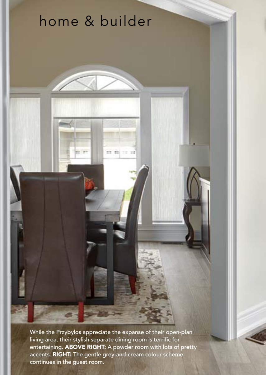
While the Przybylos appreciate the expanse of their open-plan living area, their stylish separate dining room is terrific for entertaining. ABOVE RIGHT: A powder room with lots of pretty accents. RIGHT: The gentle grey-and-cream colour scheme continues in the guest room.