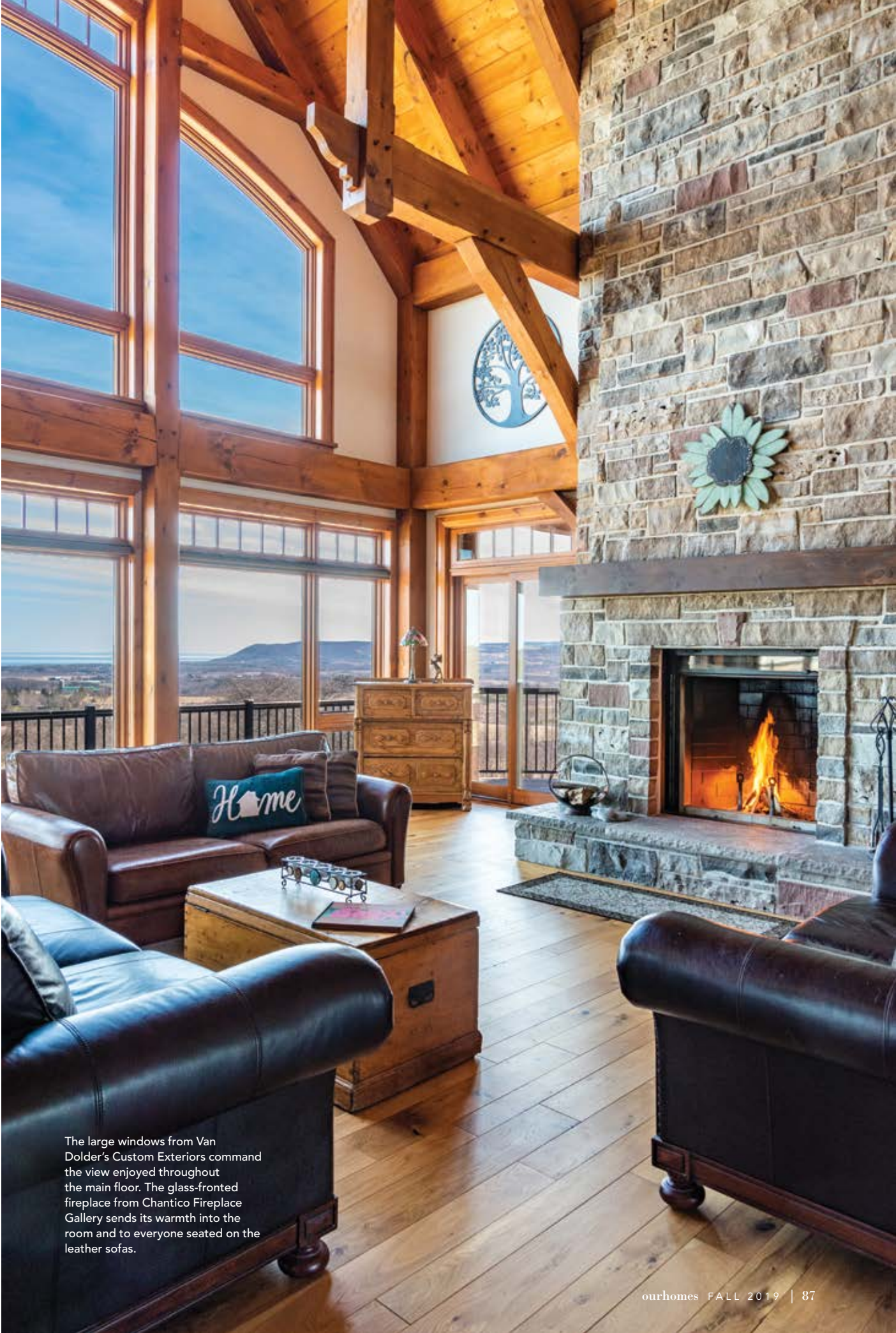
The large windows from Van Dolder’s Custom Exteriors command the view enjoyed throughout the main floor. The glass-fronted fireplace from Chantico Fireplace Gallery sends its warmth into the room and to everyone seated on the leather sofas.