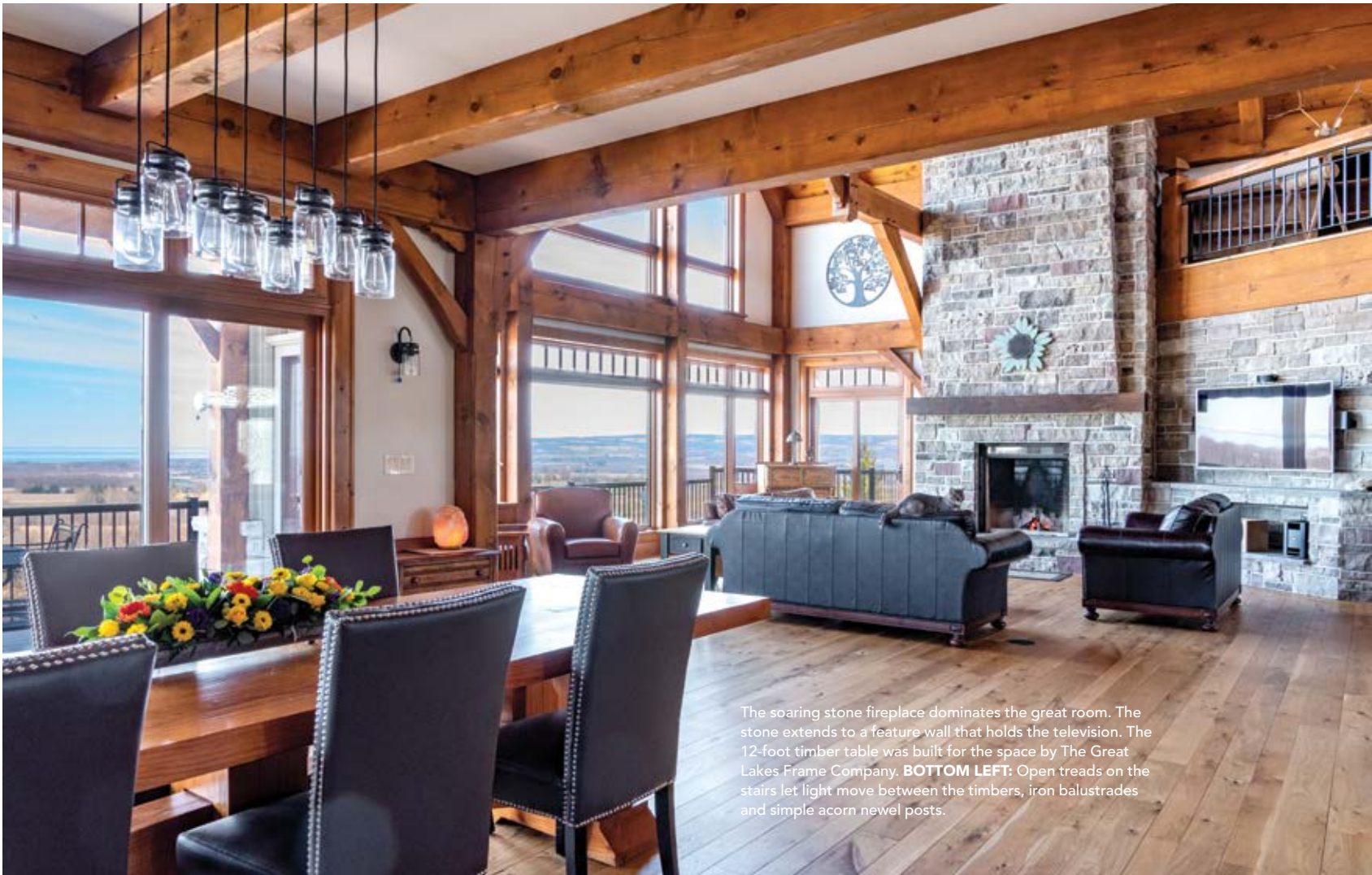
The soaring stone fireplace dominates the great room. The stone extends to a feature wall that holds the television. The 12-foot timber table was built for the space by The Great Lakes Frame Company. BOTTOM LEFT: Open treads on the stairs let light move between the timbers, iron balustrades and simple acorn newel posts.