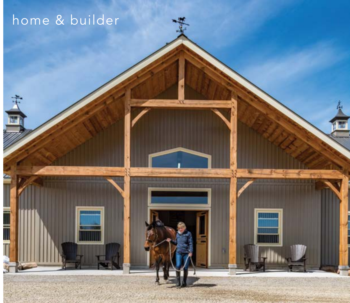
LEFT: Anne leads Gwen to the pasture. The timber frame detail on the barn is by The Great Lakes Frame Company. BELOW LEFT: Looking through the barn from the main entrance, a glimpse of the riding arena can be seen through the double doors. BELOW RIGHT: Behind the kitchen is the entrance to the garage. Large nails act as hooks for coats and hats and the benches offer a spot to comfortably put on boots. A guest bathroom is also located nearby.