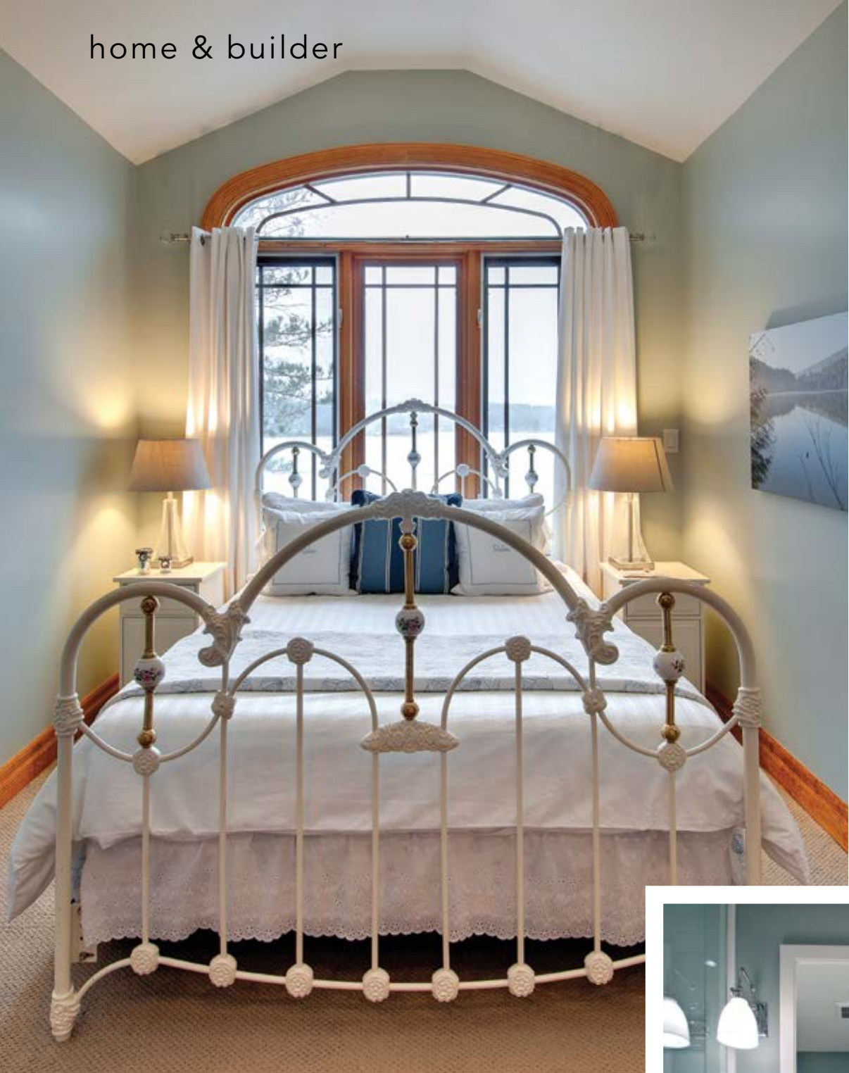
The guest room has a fabulous view of the water and easy-access to a soft-blue and white bathroom.