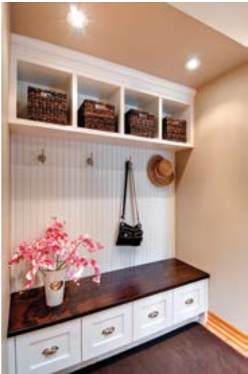
TOP: Madison Taylor Inc. renovated and transformed the entire home in four months, including this comfortable, inviting library space. ABOVE: The beach-house style continues in the laundry room and in this built-in drop-zone area. LEFT: A stunning powder room boasts a vanity with lots of storage. RIGHT: The living room is the historic home's oldest room at 110 years. Marble surrounds the wood-burning fireplace.