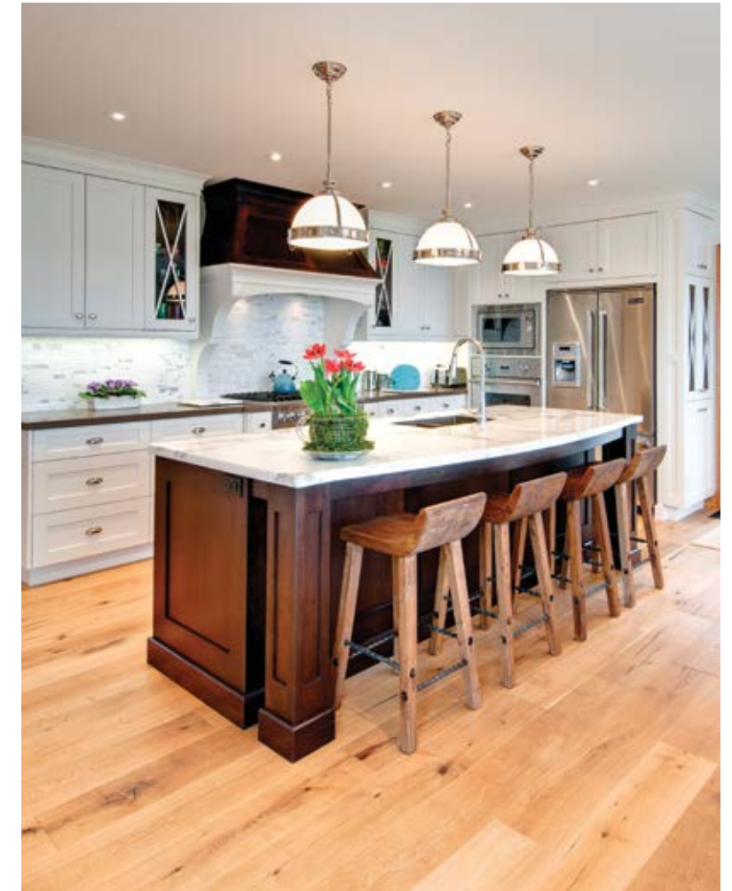
The expansive, light-filled kitchen was completely transformed to fit the Bells' beach-house vibe. The century home on the water has a rich past and a bright future.