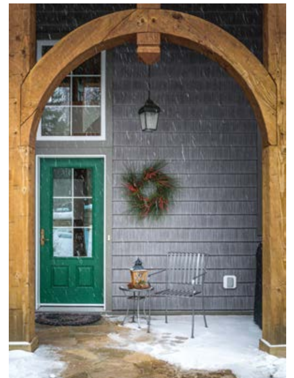
LEFT: The beverage area is located for maximum convenience and provides overflow workspace for the kitchen. ABOVE: A bent-timber arch creates a welcoming vignette. BELOW: The various wood finishes work together to create perfect harmony.