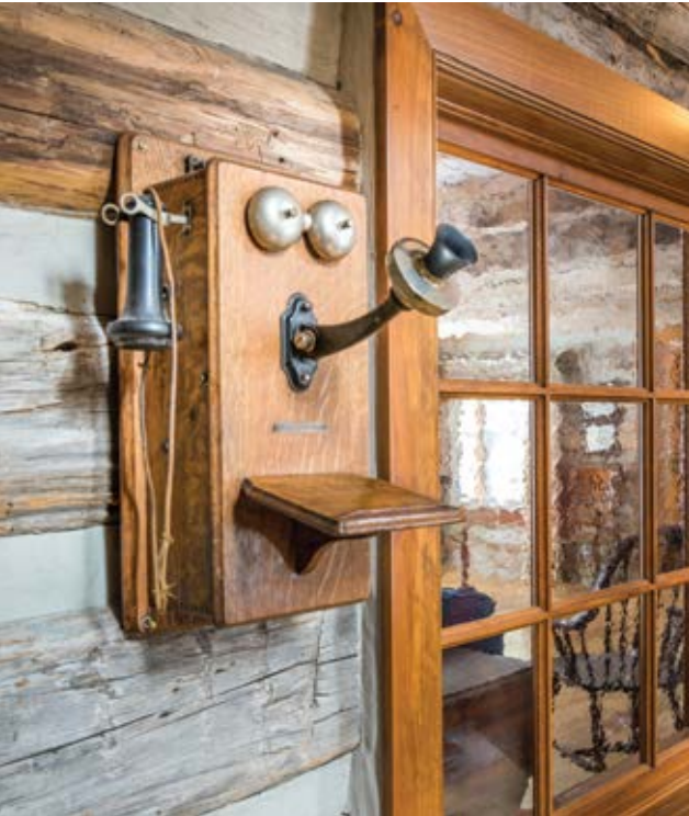
TOP: The log room embodies comfort and warmth and offers a view to the bunkie and Lake Huron beyond. LEFT: A display of an antique tea cart and a decorative mask that was collected on travels. ABOVE: The windows in the original log cabin were restored, which allows light to flow from old to new.