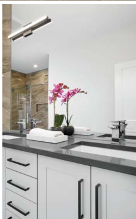
ABOVE: Main floor laundry rooms are a feature of the units at Mill Creek. RIGHT: The master bath is both functional and stylish. FAR RIGHT: An additional bedroom on the main floor serves as a quiet study or potential guest room.