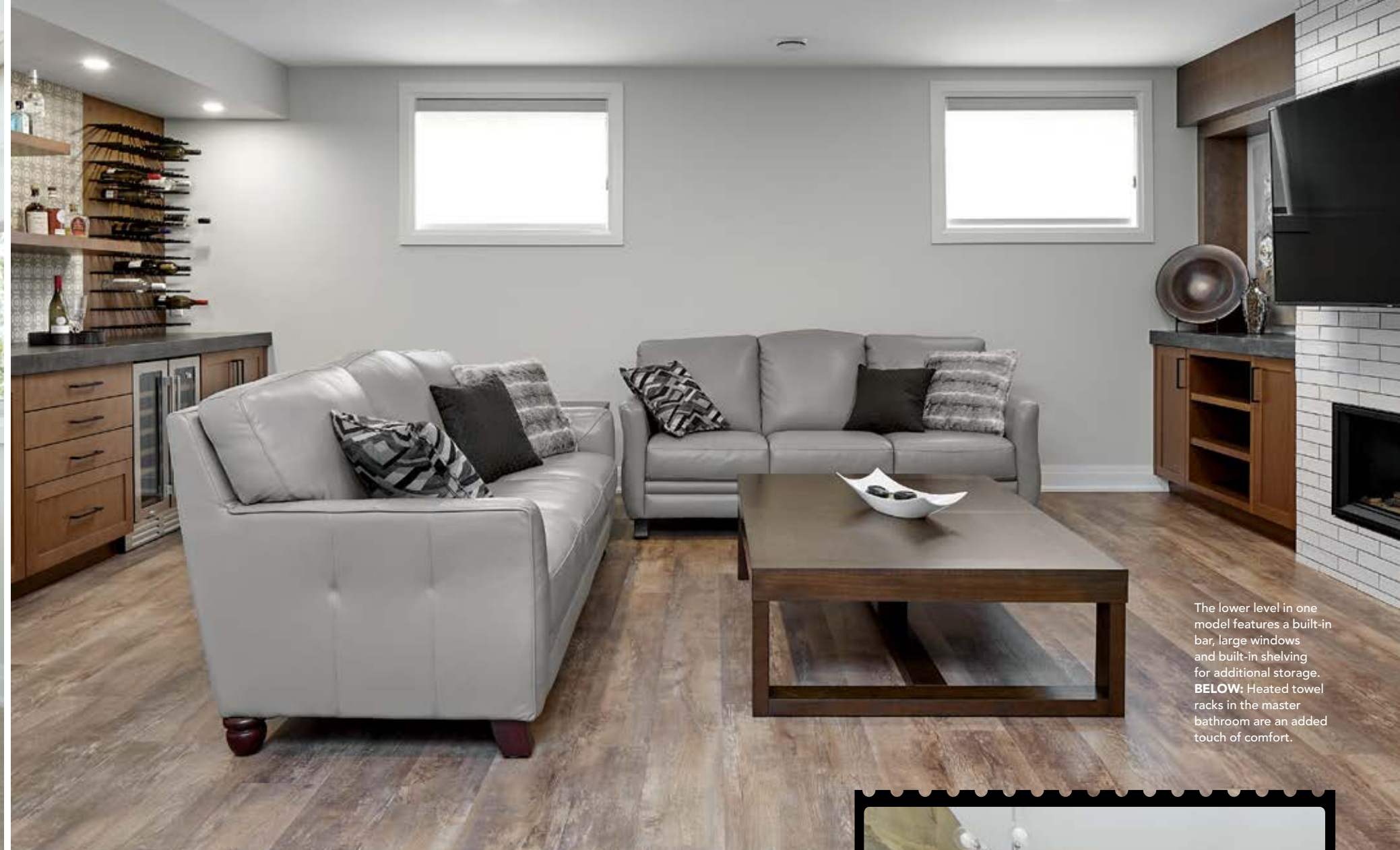
The lower level in one model features a built-in bar, large windows and built-in shelving for additional storage. BELOW: Heated towel racks in the master bathroom are an added touch of comfort.