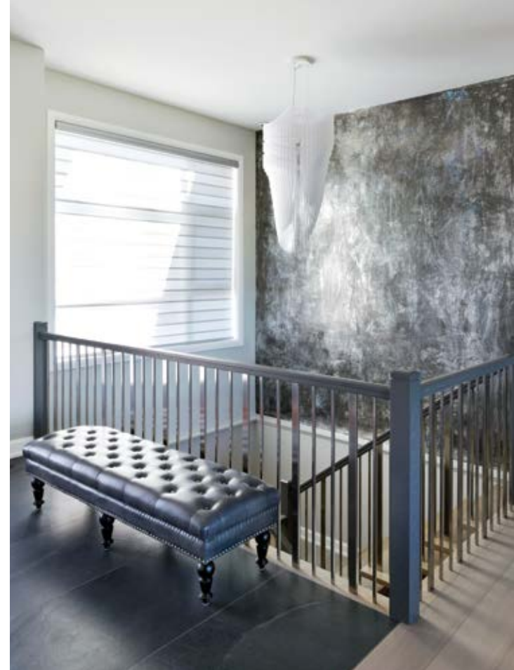
LEFT: A foil painted wall depicting an abstract of trees is found in the open stairwell leading to the lower level. BELOW: Homeowners Christine and Gord Quaile in their kitchen. BOTTOM: The fireplace column features two large slabs of travertine imported from Italy. OPPOSITE: A field of corn is the backdrop for the Quailes' contemporary bungalow in the Greely area.