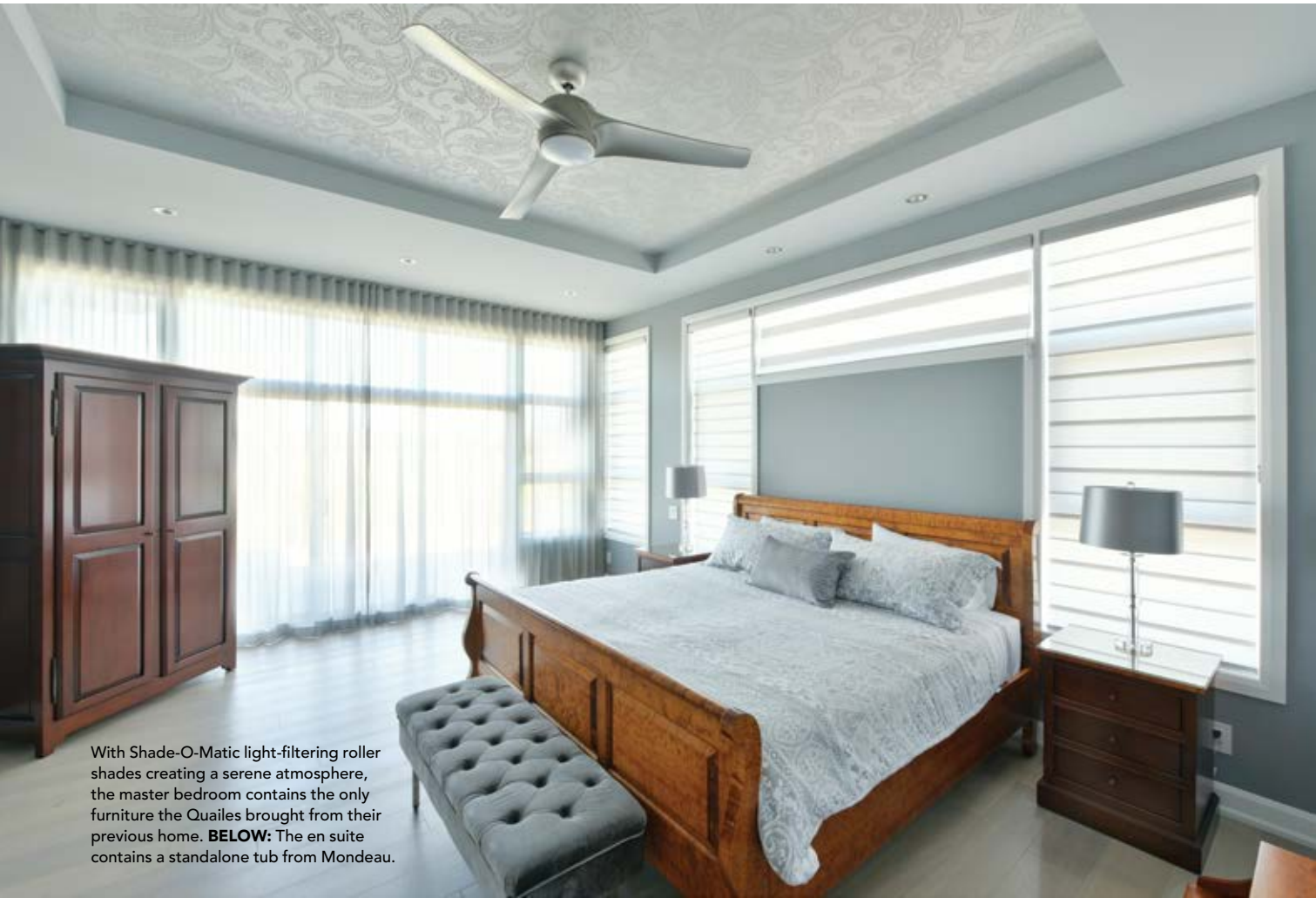
With Shade-O-Matic light-filtering roller shades creating a serene atmosphere, the master bedroom contains the only furniture the Quailes brought from their previous home. BELOW: The en suite contains a standalone tub from Mondeau.

“Isn’t it interesting we spend the first 50 years accumulating things and after that you spend your time decluttering and downsizing,” Christine says. “In this house, everything has a purpose. The only furniture we brought with us was our bedroom suite, which will be a family heirloom one day.”