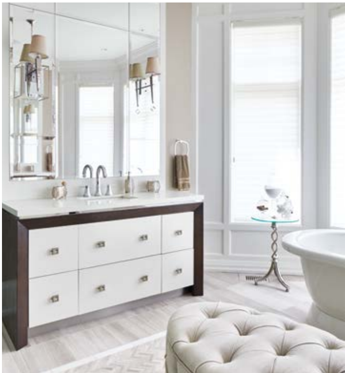
LEFT & ABOVE: The en suite’s luxurious details include tile set in a herringbone pattern, and furniture-finish cabinetry. TOP RIGHT: The backyard includes a pool, hot tub, cabana area and basketball court. TOP LEFT: The master bedroom’s vaulted ceiling treatment exudes old-world charm.