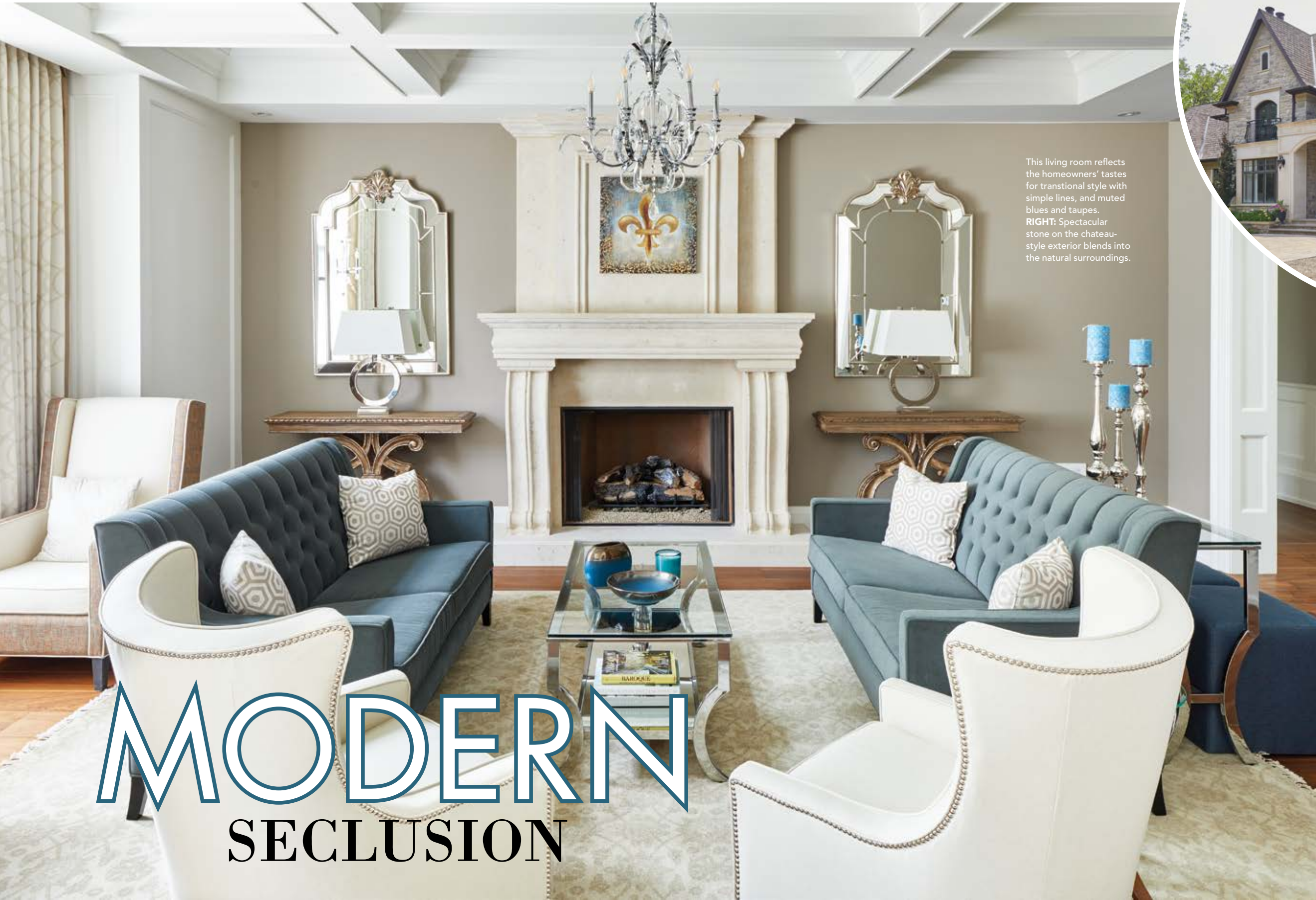
This living room reflects the homeowners' tastes for transitional style with simple lines, and muted blues and taupes. RIGHT: Spectacular stone on the chateau-style exterior blends into the natural surroundings.