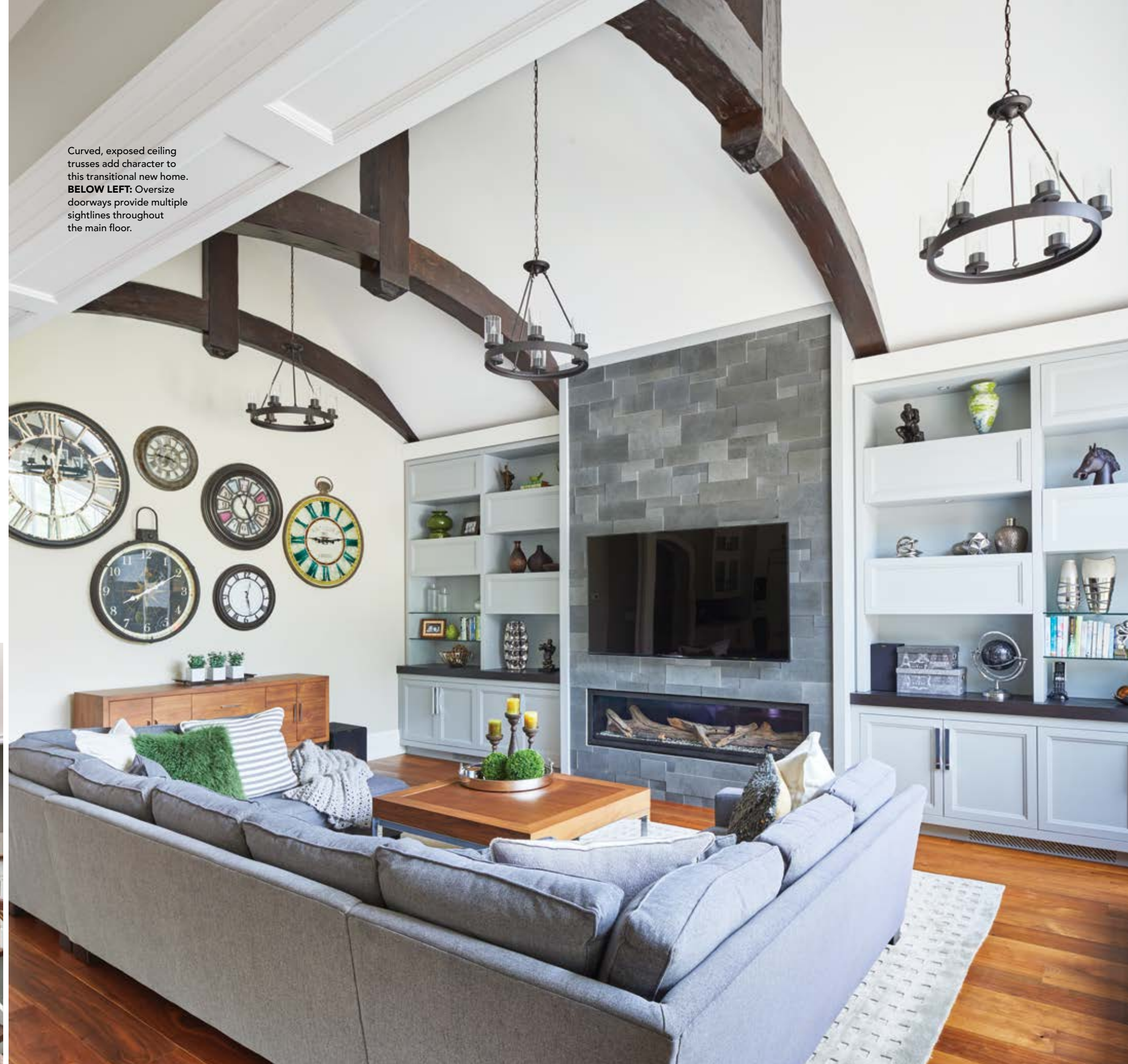
Curved, exposed ceiling trusses add character to this transitional new home. BELOW LEFT: Oversize doorways provide multiple sightlines throughout the main floor.