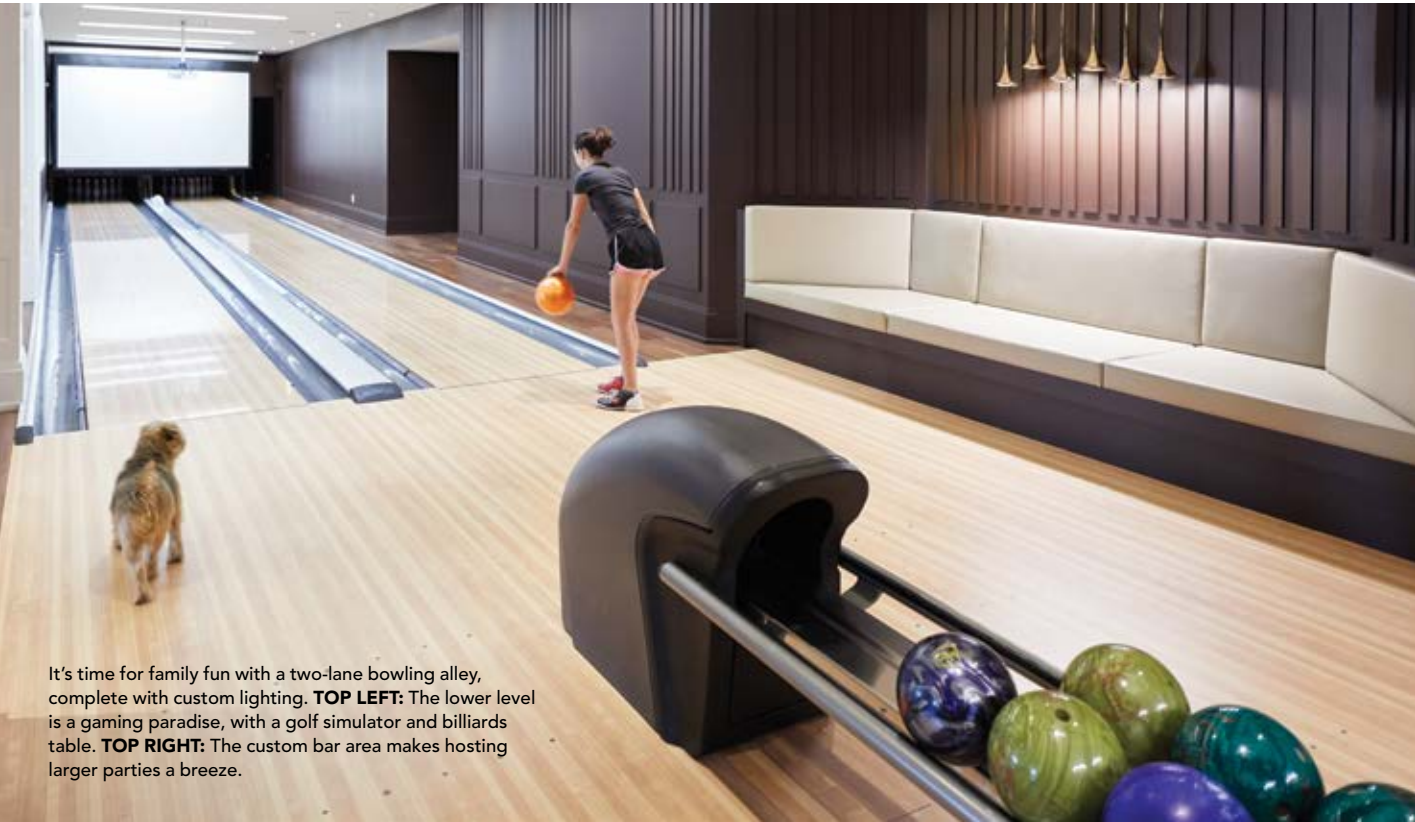
It's time for family fun with a two-lane bowling alley, complete with custom lighting. TOP LEFT: The lower level is a gaming paradise, with a golf simulator and billiards table. TOP RIGHT: The custom bar area makes hosting larger parties a breeze.