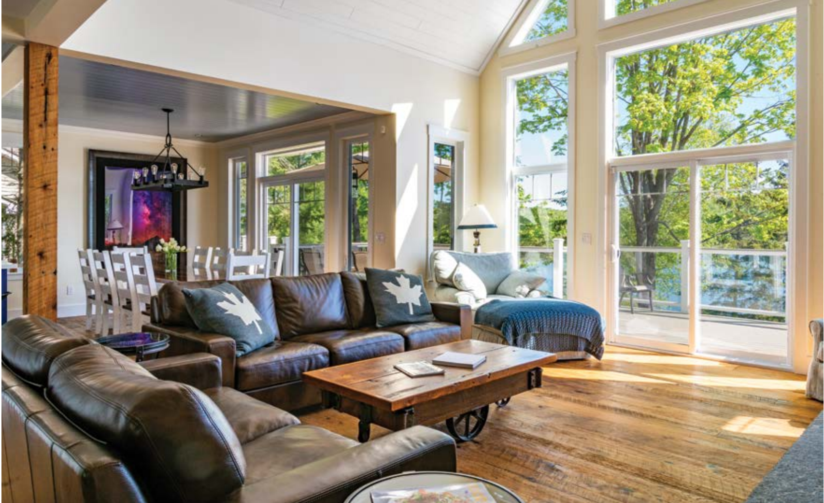
ABOVE: Potted geraniums add a flash of colour to the lakeside terrace. ABOVE RIGHT: Leather sofas in the great room are positioned for the lake view. RIGHT: Acrylic paintings of birch trees and autumn leaves by Maya Eventov flank the fireplace.

Low maintenance features were a priority throughout, including landscaping. Most notable is the siding installed by Muskoka Timber Mills , which has a Timberthane polyurethane coating that gives the wood siding a protective shell and vibrant colour. Unlike latex paints, Timberthane coating makes it nearly impossible for water, sun and abrasion to affect the wood or colouring.