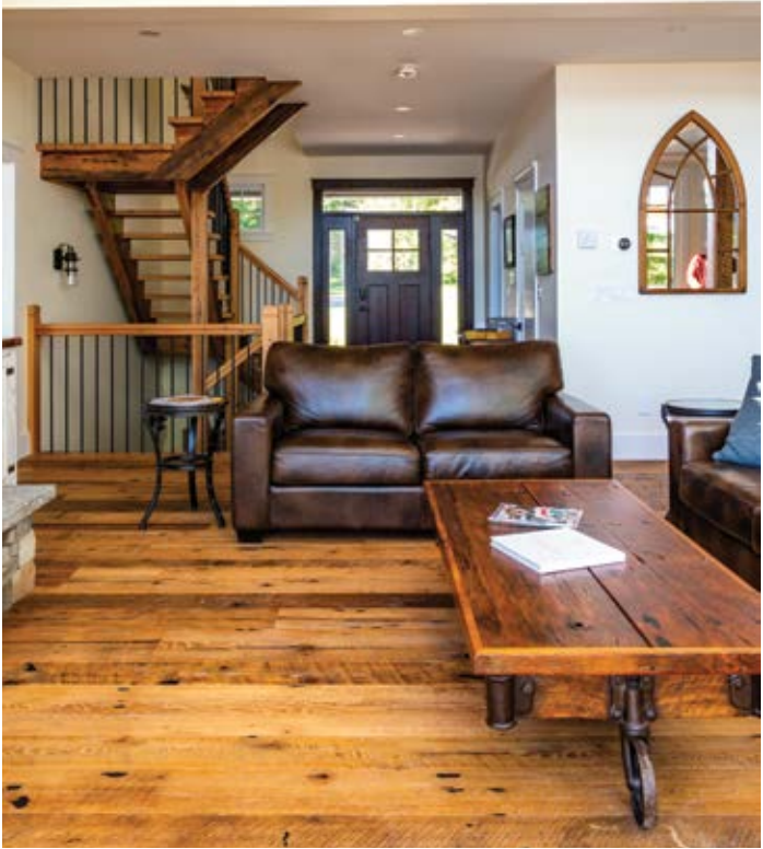
ABOVE: Reclaimed hemlock stairs by The Stair Guy Inc. ascend to a loft that overlooks the great room. LEFT: Outdoor deck chairs provide a bird’s eye view of the front terrace and lake.