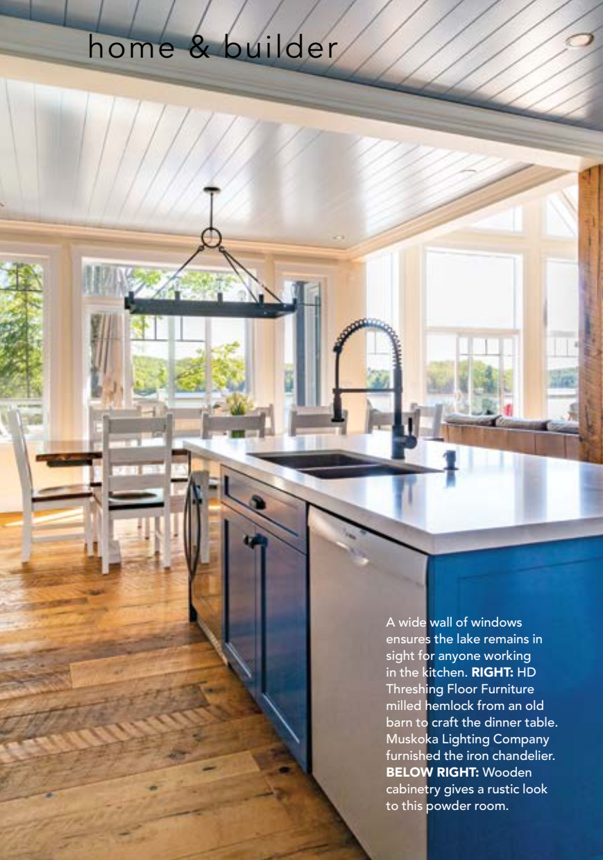
A wide wall of windows ensures the lake remains in sight for anyone working in the kitchen. RIGHT: HD Threshing Floor Furniture milled hemlock from an old barn to craft the dinner table. Muskoka Lighting Company furnished the iron chandelier. BELOW RIGHT: Wooden cabinetry gives a rustic look to this powder room.