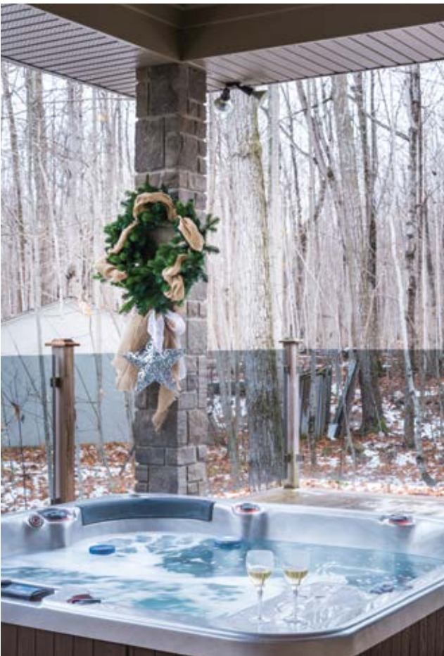
LEFT: The principal bedroom is a cosy retreat dressed in white and grey. BELOW: The covered outdoor hot tub takes in the natural splendour.