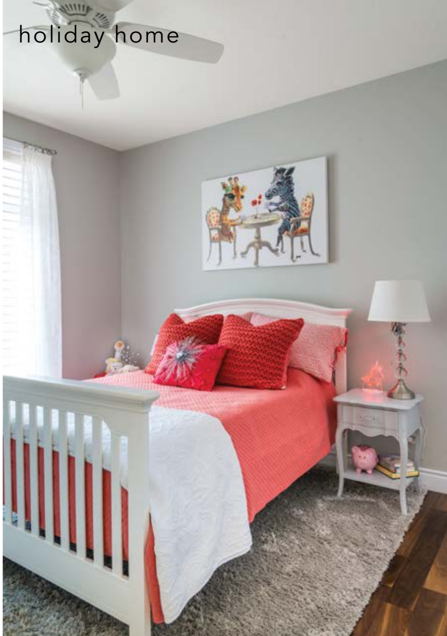
ABOVE: A pair of red knit pillows and a single large silver snowflake create a holiday vibe in Victoria's bedroom. RIGHT: The draped cedar greens are contrasted by a silver vase, frosty twigs and natural hued florals. FAR RIGHT: A large white and silver bow with an ornamental pair of crystalized figure skates adds a seasonal element to an everyday rocker.