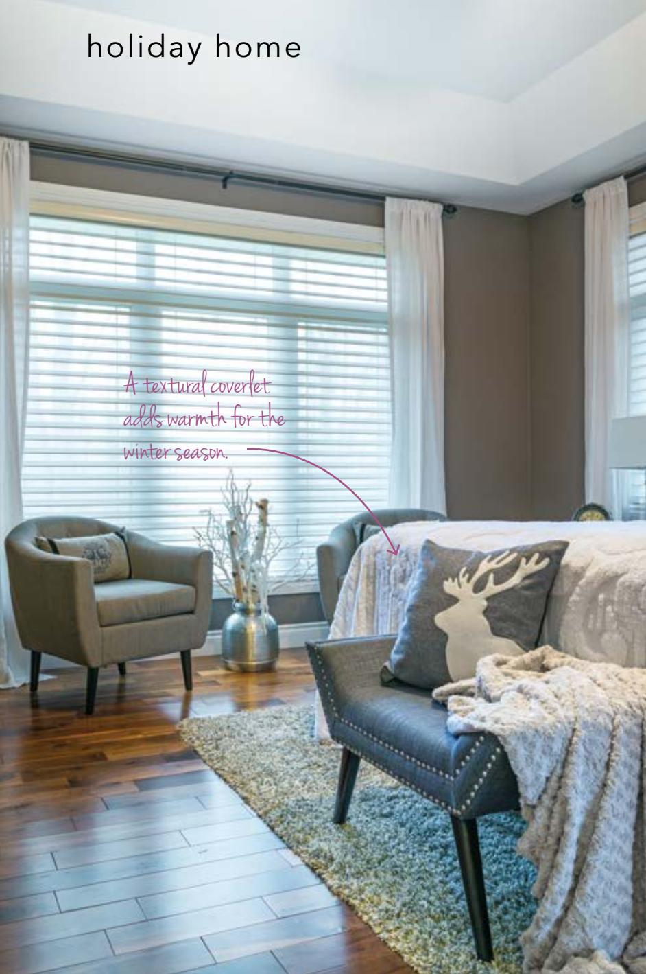
A textural coverlet adds warmth for the winter season.