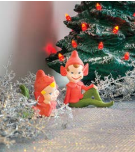
FAR LEFT: Green garland frosted with crystal accents is a seasonal touch that can remain even after the holidays end. LEFT: An elf looking slightly mischievous. BELOW: Two trees creates a suitably scaled arrangement in front of the large arch top window. OPPOSITE LEFT: Santa delivering a classic Christmas train set in Joseph’s room. TOP RIGHT: The large window grouping anchors the family gathering space and connects the indoors with nature outside. BOTTOM RIGHT: The entrance console appears as though it is under a light layer of frost.