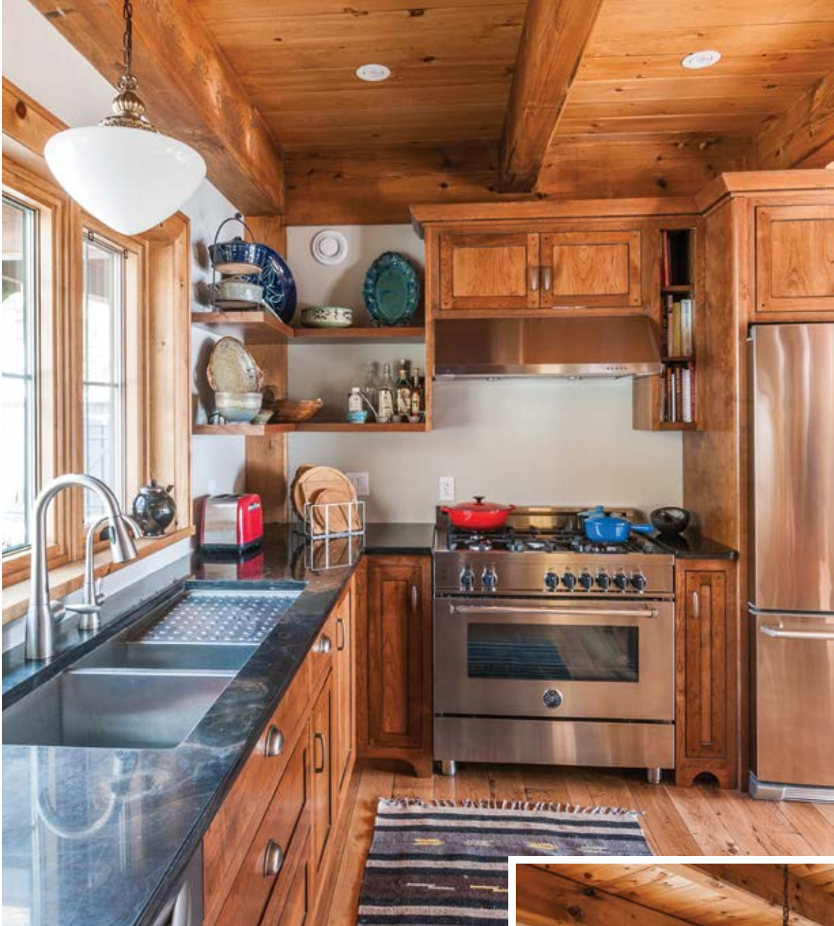
LEFT: The custom kitchen in cherry wood was built by a local Mennonite carpenter and features sleek, dark granite from The Stone Show. BELOW LEFT: The main floor living area is comprised of an open-concept kitchen and dining area and a family lounge. BELOW RIGHT: A solid wood dining table from County Charm Mennonite Furniture has a sweeping view of the bay.