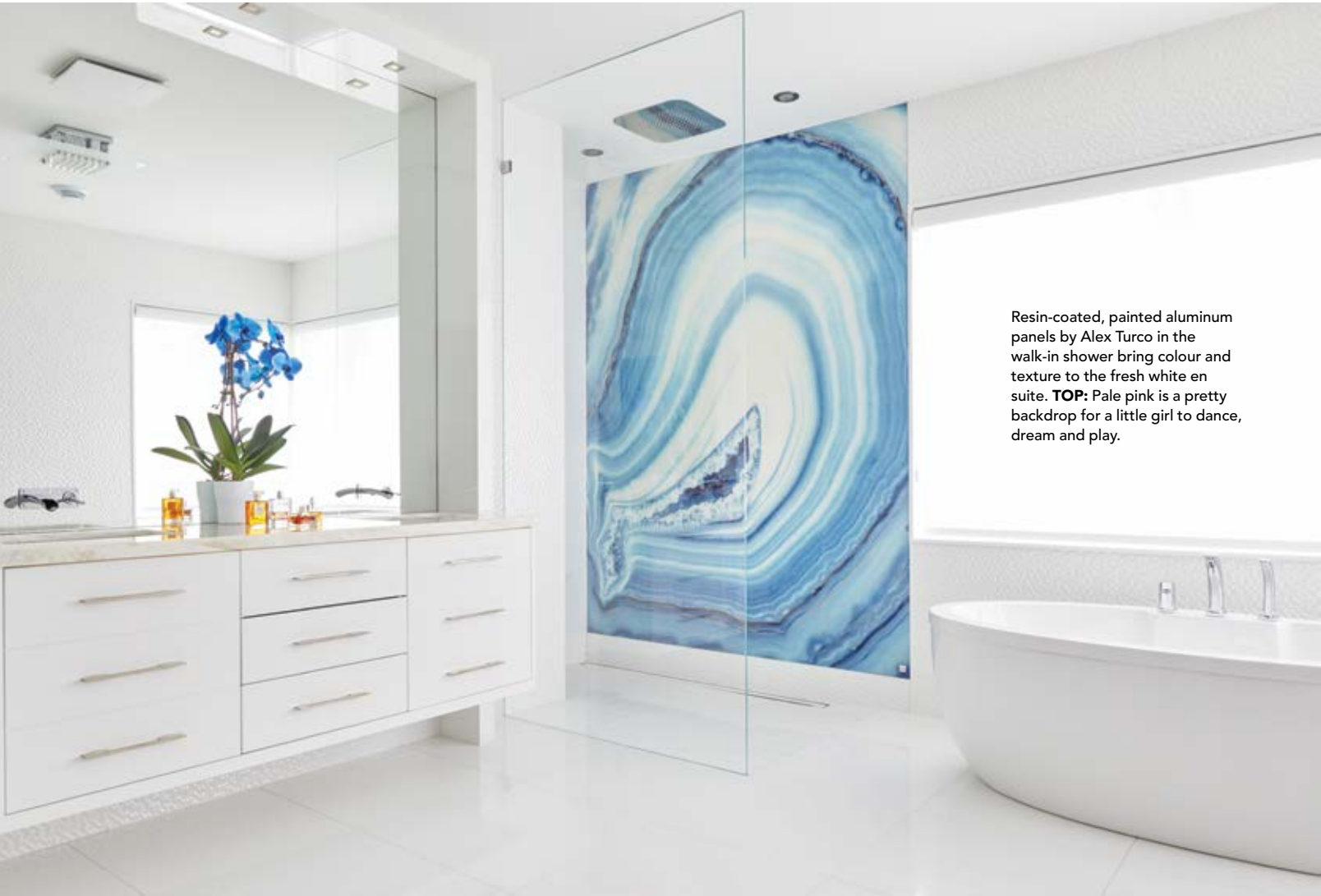
Resin-coated, painted aluminum panels by Alex Turco in the walk-in shower bring colour and texture to the fresh white ensuite. TOP: Pale pink is a pretty backdrop for a little girl to dance, dream and play.