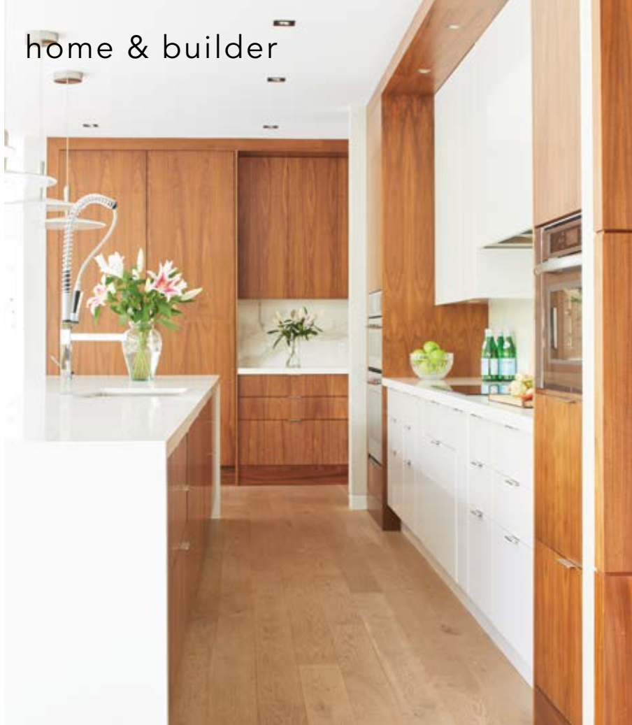
ABOVE: Warm wood tones blend effortlessly with crisp white elements. TOP RIGHT: Set against the windows, the integrated bar area is centrally located for enjoyment indoors or out. RIGHT: The dining room is positioned to enjoy sweeping views of the backyard. OPPOSITE: The tranquil backyard is a place for rest and refuge for the couple and their three young children.