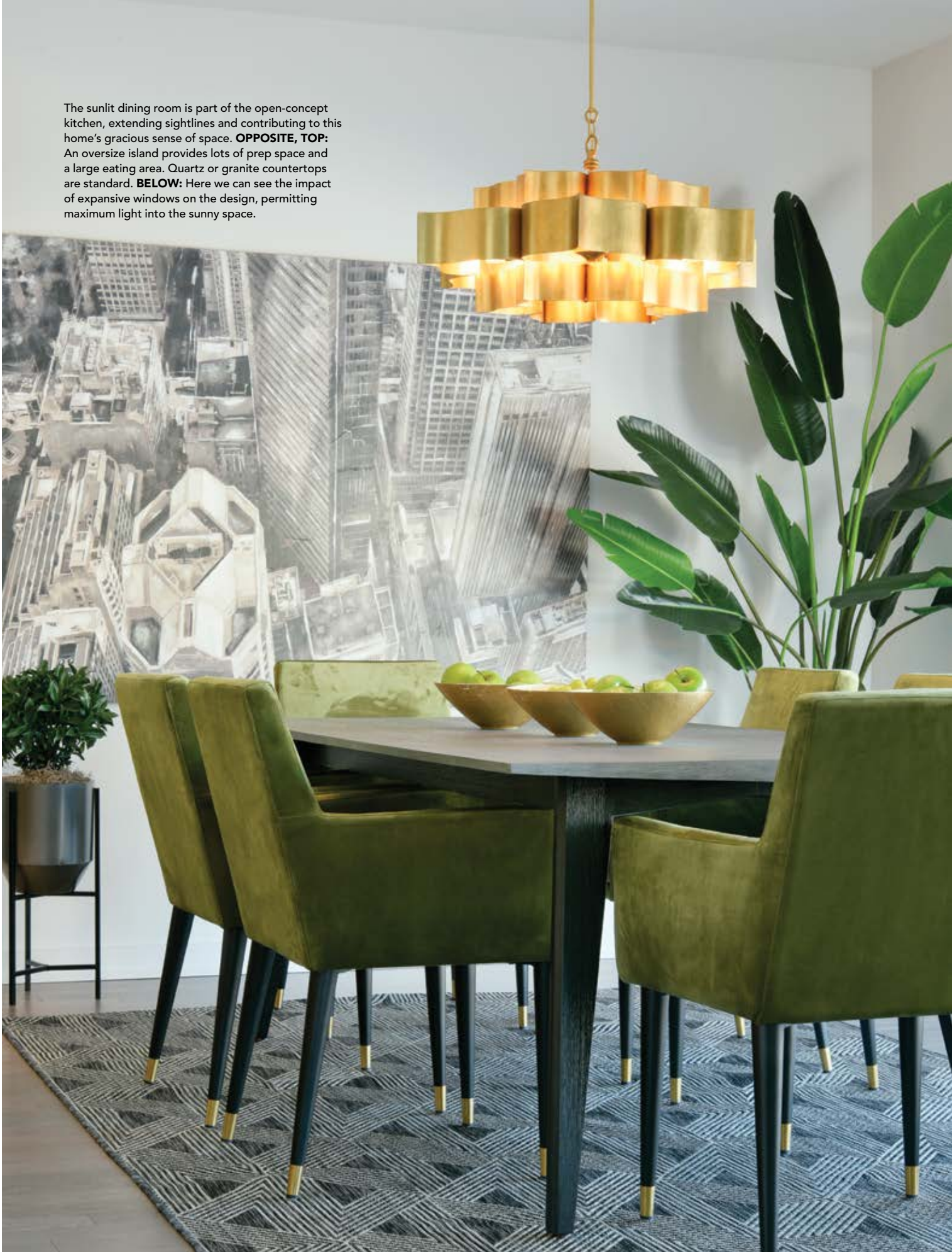
The sunlit dining room is part of the open-concept kitchen, extending sightlines and contributing to this home’s gracious sense of space. OPPOSITE, TOP: An oversize island provides lots of prep space and a large eating area. Quartz or granite countertops are standard. BELOW: Here we can see the impact of expansive windows on the design, permitting maximum light into the sunny space.