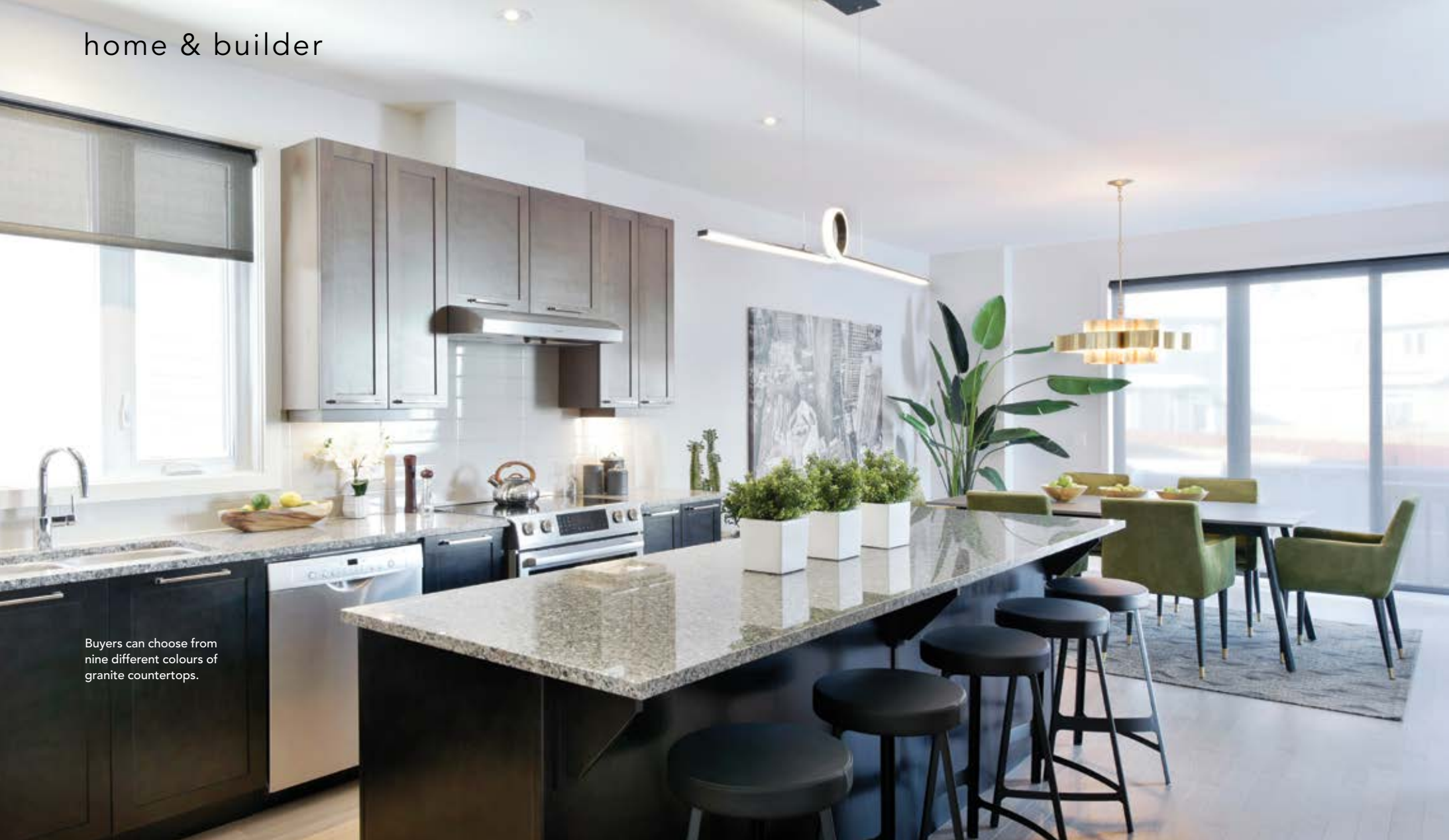
Buyers can choose from nine different colours of granite countertops.