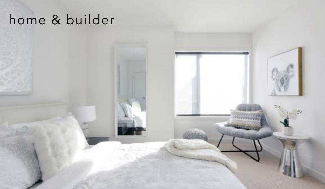
LEFT: Large windows aren't just for the main floor. All bedrooms feature large windows to usher in as much light as possible. BOTTOM LEFT: The secondary bedrooms are sizeable and bright. BOTTOM RIGHT: Placing the toilet and shower in a private enclosure in the bathroom makes it easier to share the space.

You can see the loft space upstairs from the living room downstairs. The hardwood staircase ( Ottawa Valley Handrailing Company Ltd. ) is another standard feature that feels like an upgrade, eschewing traditional spindles and railings for a more streamlined approach that incorporates glass panels for a modern, airy feel.