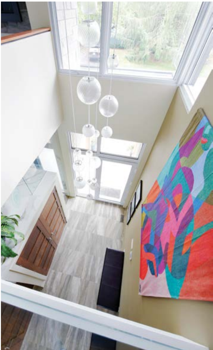
RIGHT: Vaulted ceilings with windows to match amplify the sense of space. LEFT: An enclosed porch provides a cosy corner for the hot tub.