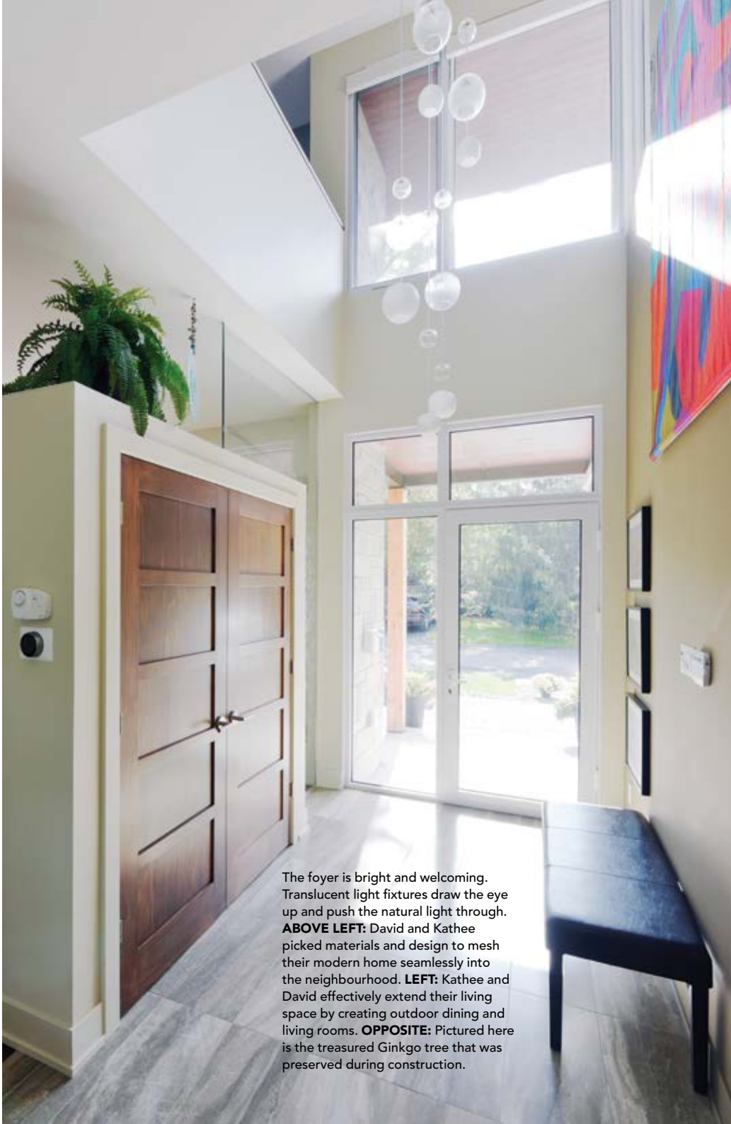
The foyer is bright and welcoming. Translucent light fixtures draw the eye up and push the natural light through. ABOVE LEFT: David and Kathee picked materials and design to mesh their modern home seamlessly into the neighbourhood. LEFT: Kathee and David effectively extend their living space by creating outdoor dining and living rooms. OPPOSITE: Pictured here is the treasured Ginkgo tree that was preserved during construction.

There were no drapes or furniture apart from some lawn chairs; the house construction was nearing completion and there was a snow storm outside. It was New Year's Eve 2016. Kathee and David had a picnic dinner and watched neighbourhood couples walk hand in hand ready to ring in the New Year and waving welcomingly as they passed their home. The room was lit with candles and a fire in the