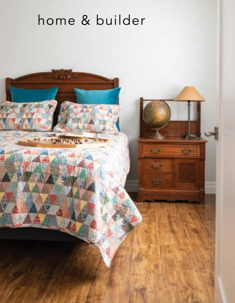
LEFT: With its patchwork quilt and turquoise Euro pillows, the antique bed is a welcome spot for a good night's sleep, or a game of crokinole. BELOW: The second floor bathroom has everything for a spa experience. The tile used on the floor extends into the glass-enclosed shower. There is also a window over the vessel tub. BOTTOM: In one boy's bedroom, a large closet stows all his ski gear. The Navajo-inspired quilt injects some colour into this neutral room. Bedding in both bedrooms was sourced at Clarkson's Home Store.