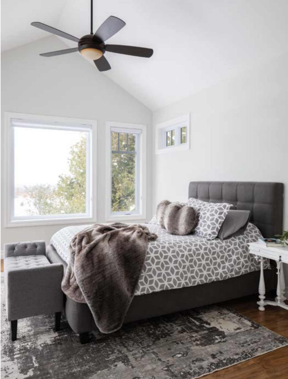
RIGHT: The colour grey is used again in the master bedroom to create a calm serene space. There is a view over the pool and to the fields beyond plus an entrance to the upper deck. Fur throw and pillows from Clarkson's Home Store. BELOW: The floating vanity in the master bath has lots of storage. The linear mirror and light above draw the eye along to expand the space and offer a glimpse into the large shower. Located beside the en suite is a walk-in closet.