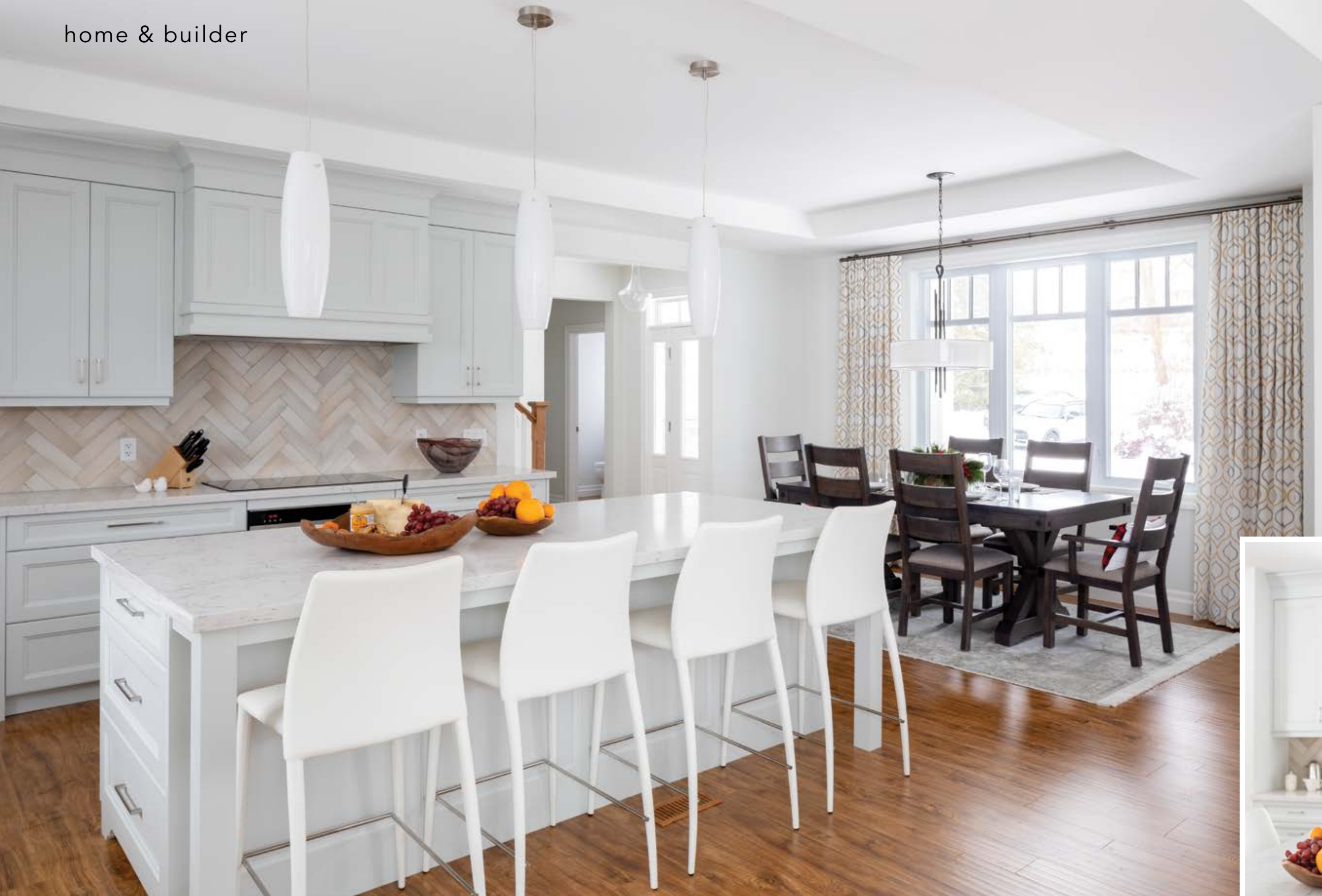
ABOVE: Corinthian Kitchen & Bath Studio designed the large, functional kitchen. There are enough stools for the whole family to grab breakfast before heading to the slopes. The cabinets reach to the ceiling and are painted Wickham Gray by Benjamin Moore. RIGHT: With guests arriving shortly, a large piece of Parmesan cheese is ready to be enjoyed. Wooden dishes are from Clarkson's Home Store. Oranges and cheese provided by Goldsmith's Orchard Market.