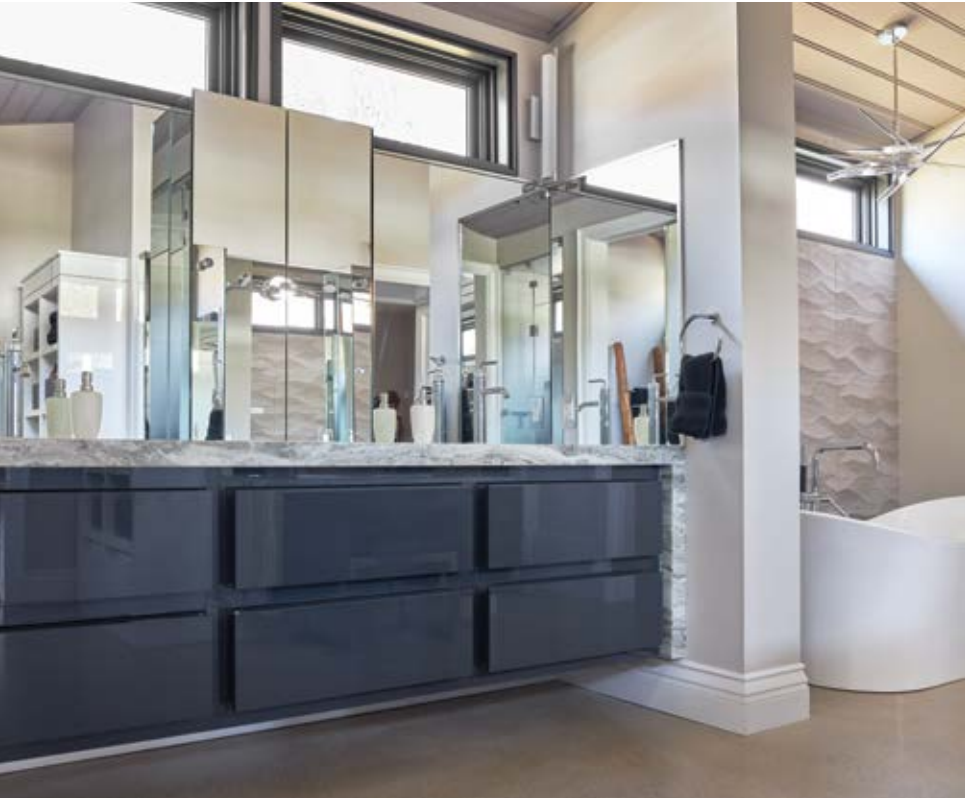
ABOVE: A mirrored display area was created in the original window space. LEFT: Located in the original veranda space, this contemporary master en suite has poured concrete and radiant-heated floors. BELOW: The windows above the tub allow treetop views from the front yard.