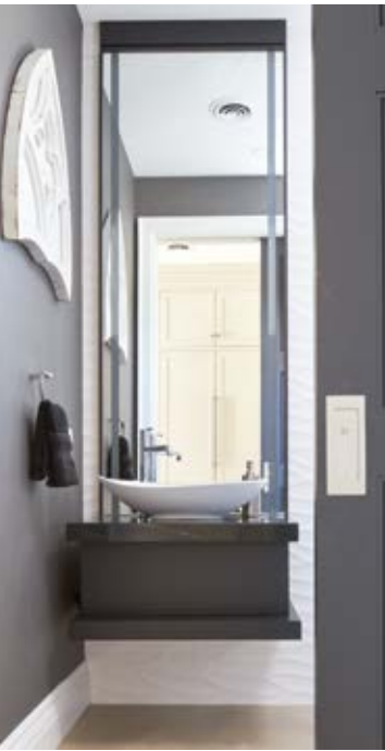
LEFT: Lucy, the family's German short-haired pointer, in her favourite spot – the sunny breezeway. ABOVE: The main floor powder room. TOP: The living room offers a view to the river and casual family living.