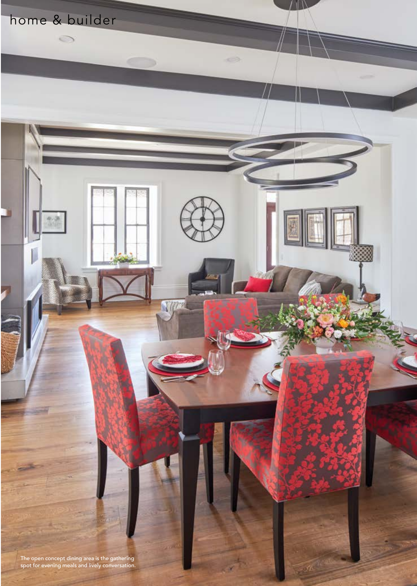
The open concept dining area is the gathering spot for evening meals and lively conversation.