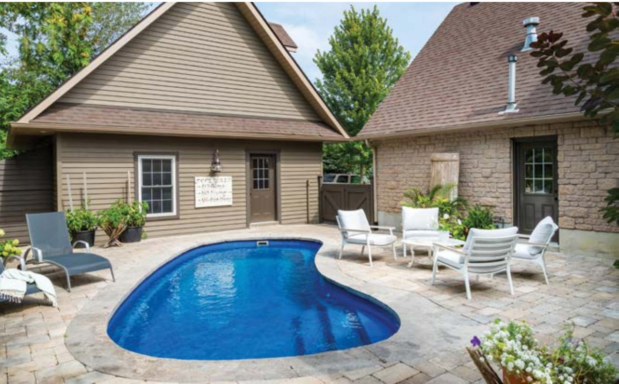
ABOVE: The '69 Camaro has pride of place. With tools and Mario's expertise, this beauty is in top shape. LEFT: The kidney-shaped pool installed by Zeng Landscaping is in a sheltered and private corner of the rear garden, perfect for sunbathing.

love our neighbourhood. Our children have grown up on these streets, free to roam and play with their friends. There's a real feeling of community here, and we're grateful the renovations we made to our home allowed us to stay," says Katherine. OH