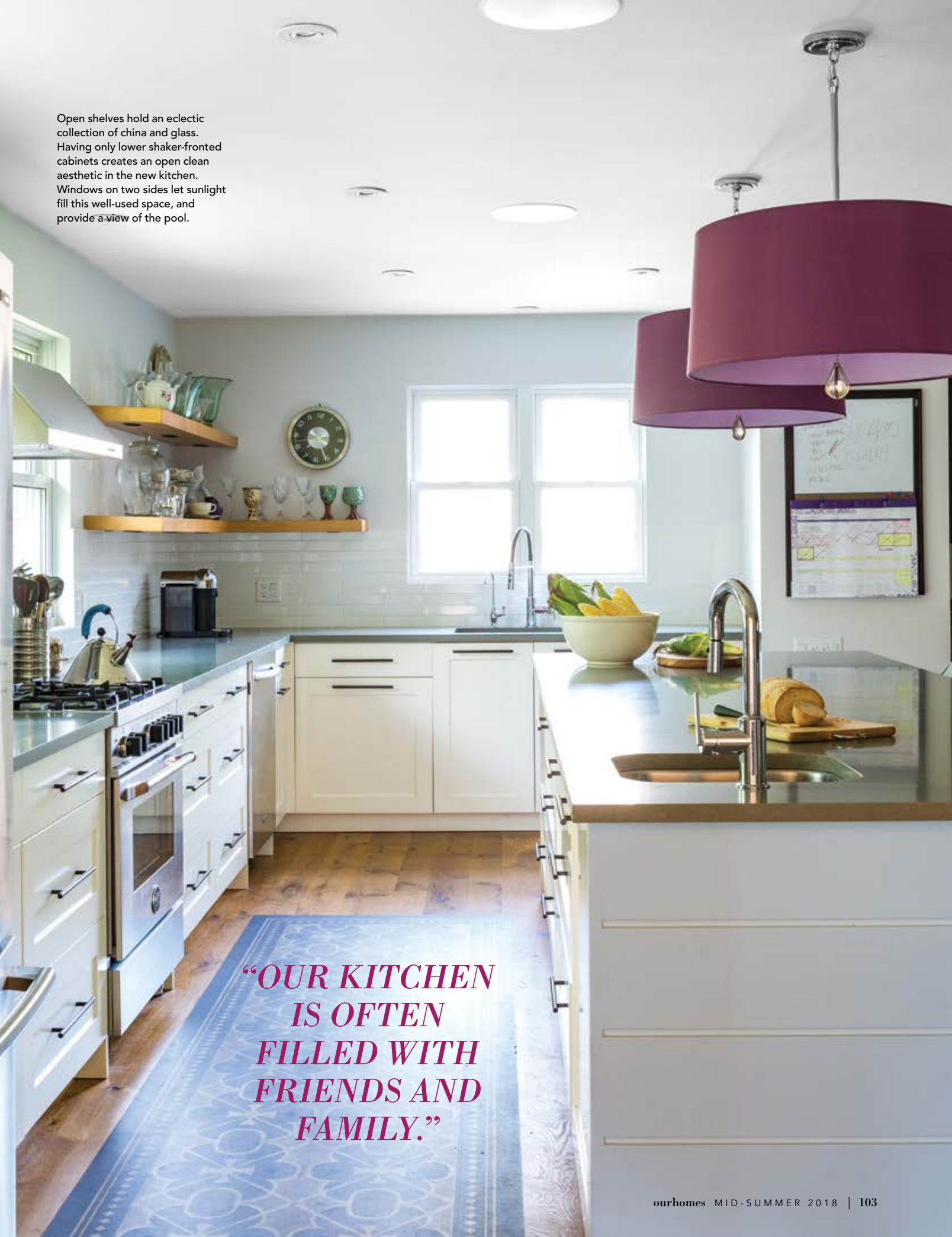
Open shelves hold an eclectic collection of china and glass. Having only lower shaker-fronted cabinets creates an open clean aesthetic in the new kitchen. Windows on two sides let sunlight fill this well-used space, and provide a view of the pool.

“OUR KITCHEN IS OFTEN FILLED WITH FRIENDS AND FAMILY.”