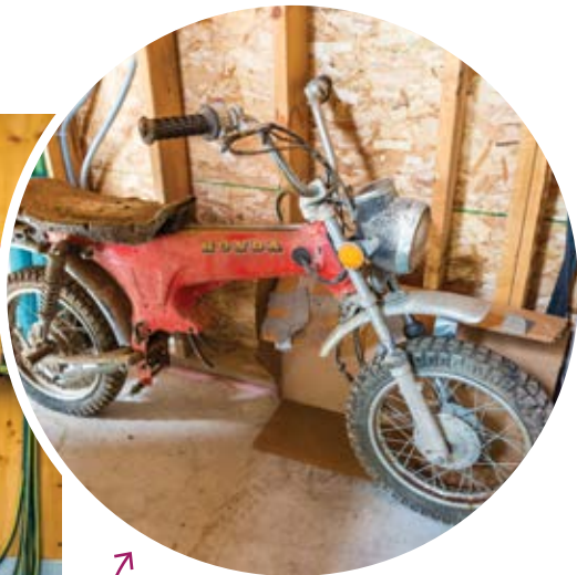
The Honda dirt bike waits in another garage to be cleaned and tuned up for its next ride.