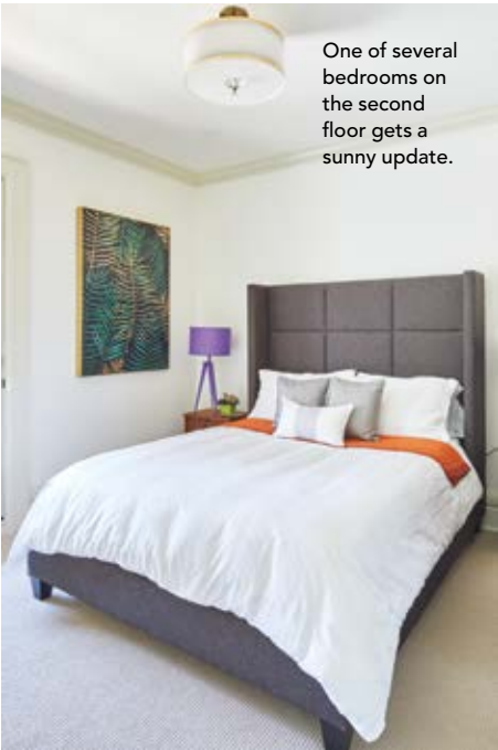
One of several bedrooms on the second floor gets a sunny update.