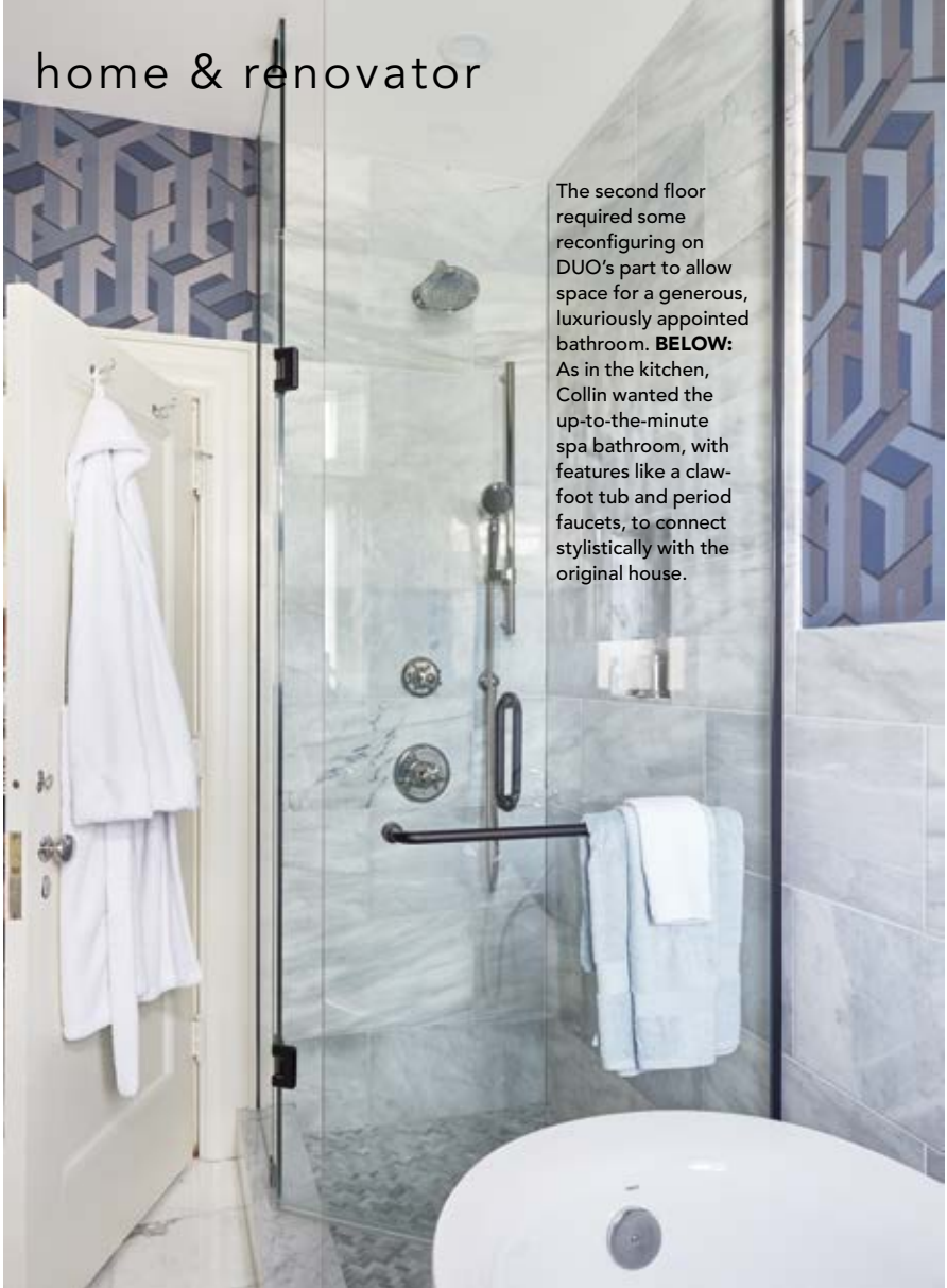
The second floor required some reconfiguring on DUO's part to allow space for a generous, luxuriously appointed bathroom. BELOW: As in the kitchen, Collin wanted the up-to-the-minute spa bathroom, with features like a claw-foot tub and period faucets, to connect stylistically with the original house.