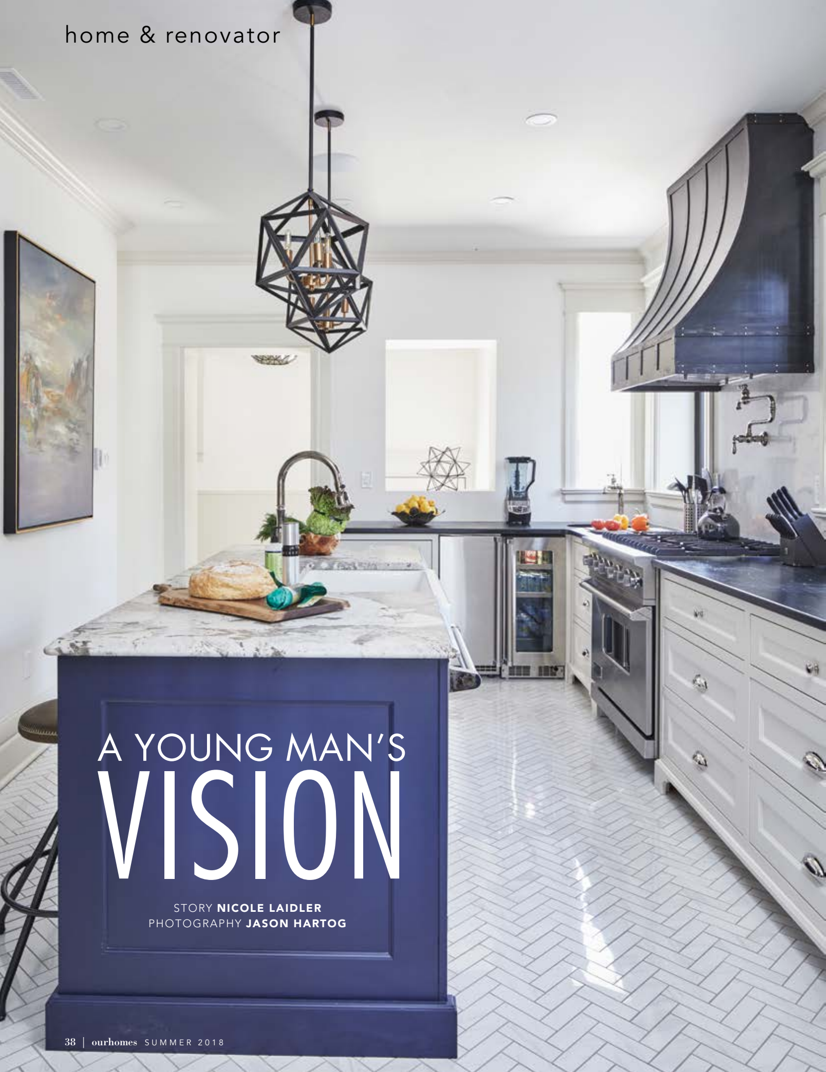
BELOW: DUO created space behind the kitchen for a spacious mudroom. Roth Design built the bench. BOTTOM: A handy beverage centre tucks into an alcove beside the fridge. RIGHT: New cabinetry and finishes are a serious nod to the era of the home. OPPOSITE: The reconfiguration of space delivered a stylish and functional layout.