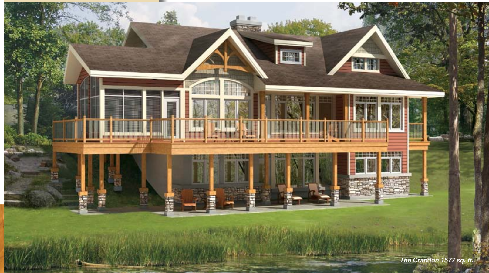
The Crandon 1577 sq. ft.

Imagine this house on your wooded or lakefront lot