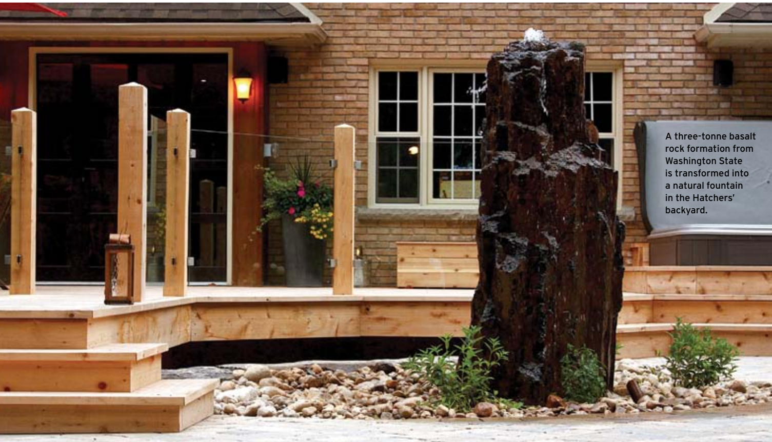
A three-tonne basalt rock formation from Washington State is transformed into a natural fountain in the Hatchers' backyard.