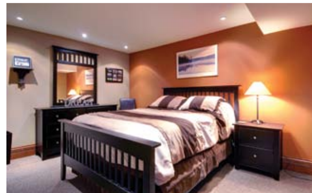
The comfortable master bedroom is a "wonderful place to be" for the couple. TOP RIGHT: A compromise between mother and son, one bright green wall adds a splash of colour to the teenager's bedroom. RIGHT: Making excellent use of a long basement, a wooden room divider creates a cosy guest sleeping space off of the rec room.