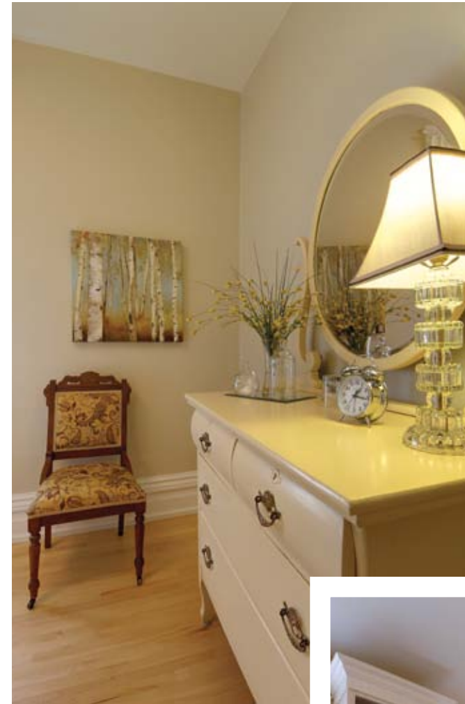
FROM LEFT TO RIGHT: (1) A warm front foyer invites guests in and leads the way upstairs to the three suites. (2 & 3) The Nellie McClung guest room features a king size bed that can be separated into two twin beds, and a full en suite complete with double sinks and a jet tub. (4) The Cavell Room is bright and sunny with charming yellow décor. (5) The upstairs landing glows with natural light. The built-in window bench is an ideal spot to read a good book and the computer nook offers Internet access, though there is wireless throughout the B&B.

The resulting B&B is inviting, bright and comfortable, having the charm of a century home with modern conveniences, including soundproof walls, in-room climate controls, on-demand water heating with heated towel racks (maintained by L-Ray Plumbing & Heating in Chesley), flat-screen televisions and wireless Internet. “To see it come into fruition, it took a long time,” admits Potvin. “We did it ourselves; two buckets at a time removing the lath and plaster. It takes forever before you see the signs of it coming together.” The couple did the bulk of the loving restoration work themselves, but say they couldn’t have completed it without help from family and friends.