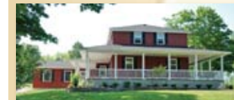
Spectacular Country Home. 3 yrs old. Over 6 acres + insulated shop & horse stalls. $539,900