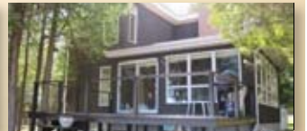
Waterfront. 248' shoreline. Boat channel. Bridge. 3 bdrm Viceroy Island View Drive. $547,900

RE/MAX GREY BRUCE REALTY INC., BROKERAGE