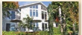
McCulloch Lake Waterfront. Open concept home + 3 bdrm bunkie. Dock & boats. $499,900