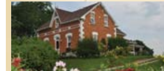
Red Brick Circ 1884. Lovingly restored & updated. 98 acres. Pond. Maple Bush. $469,900