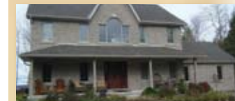
Waterfront Privacy Georgian Bay. 6.9 treed acres 5 year old stone home. $985,000