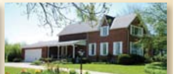
Waterview Farm. 110 acres. 2 ponds. Two houses. Main house 3 bdrms + bungalow. $895,000