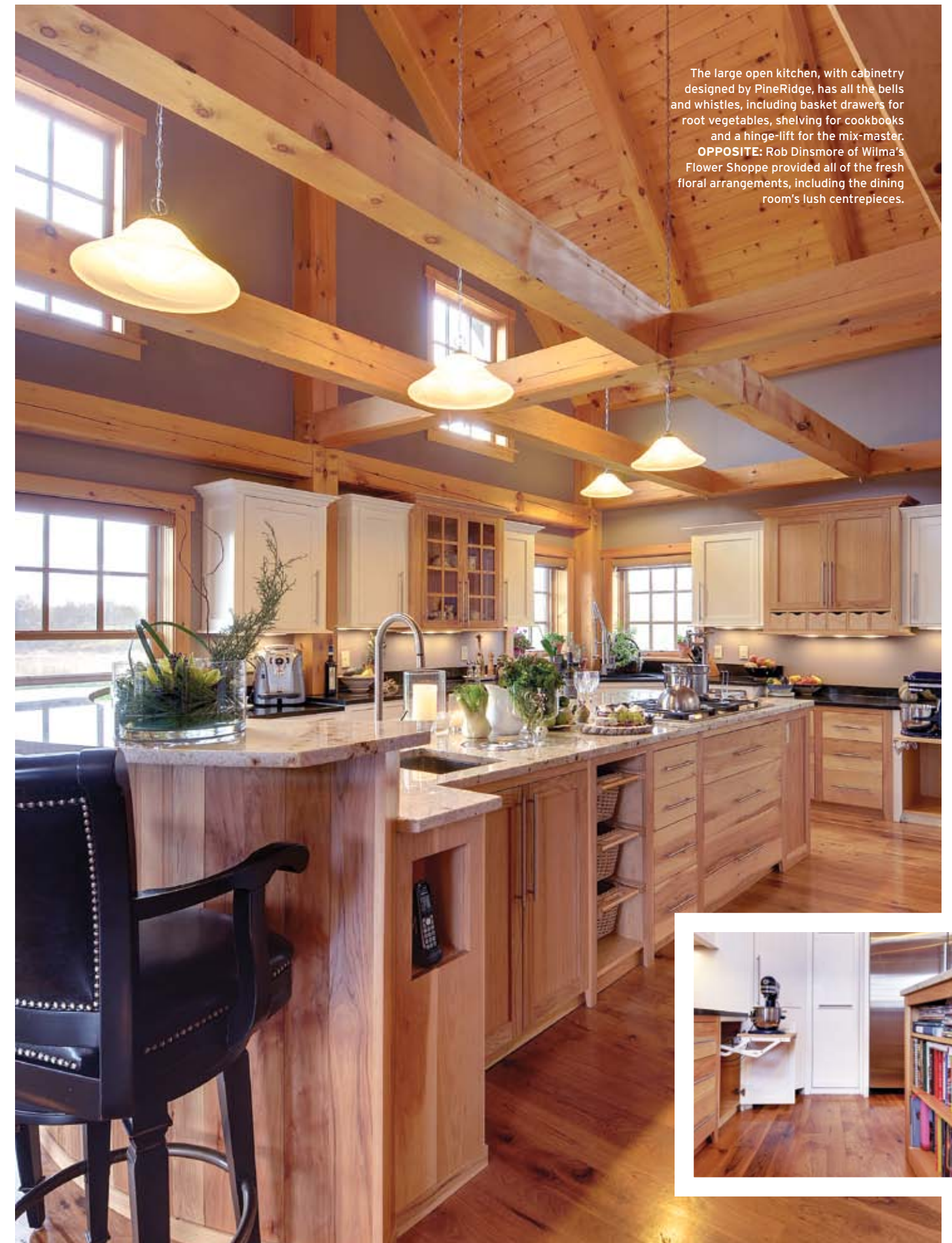
The large open kitchen, with cabinetry designed by PineRidge, has all the bells and whistles, including basket drawers for root vegetables, shelving for cookbooks and a hinge-lift for the mix-master. OPPOSITE: Rob Dinsmore of Wilma's Flower Shoppe provided all of the fresh floral arrangements, including the dining room's lush centrepieces.