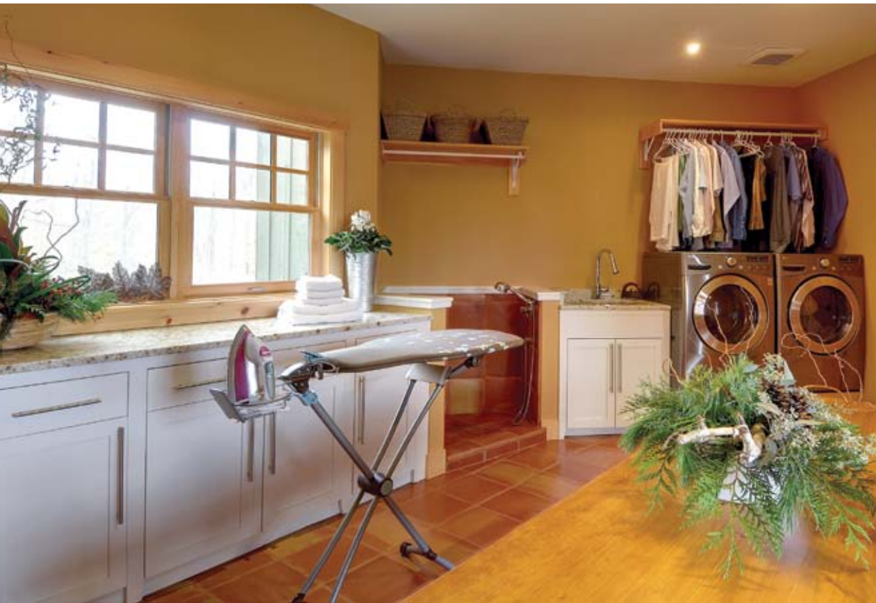
LEFT: A fabulous mudroom/laundry room keeps the Becks family clean and organized. Ample storage, coat hooks, a large folding table and a dog shower station are all geniusly integrated into this functional space. BELOW: Greg's downstairs bar brings back memories of the birch and pine trees on Manitoulin Island, where he grew up.

The couple wanted a bar in the basement. "When Greg told me about his family origins on Manitoulin Island, that he was quite fond of the birch and pine trees up there, we incorporated those two woods to build a whimsical log bar," says Mader. The resulting counter has a cutout for the sink and the mirror on the wall above is framed with birch saplings.