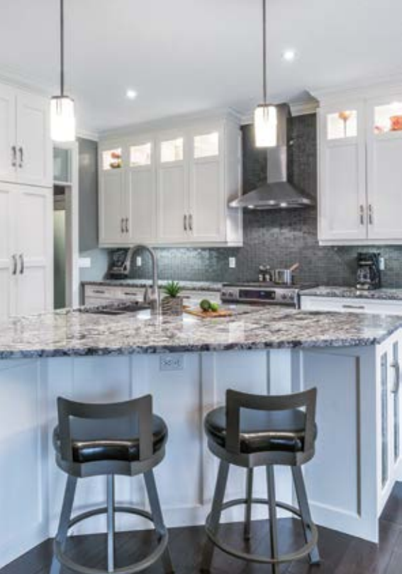
LEFT: The custom white kitchen has sharp contemporary accents, such as a visually dominating stainless steel vent hood and glass backsplash mosaic, set against a more traditional granite countertop. BELOW: The dining area looks out on the property's view of the Saugeen River. BOTTOM LEFT: The Wilsons' office is full of fun memorabilia, including a model boat, a radio designed to look like a toolbox, and a vintage gas pump.