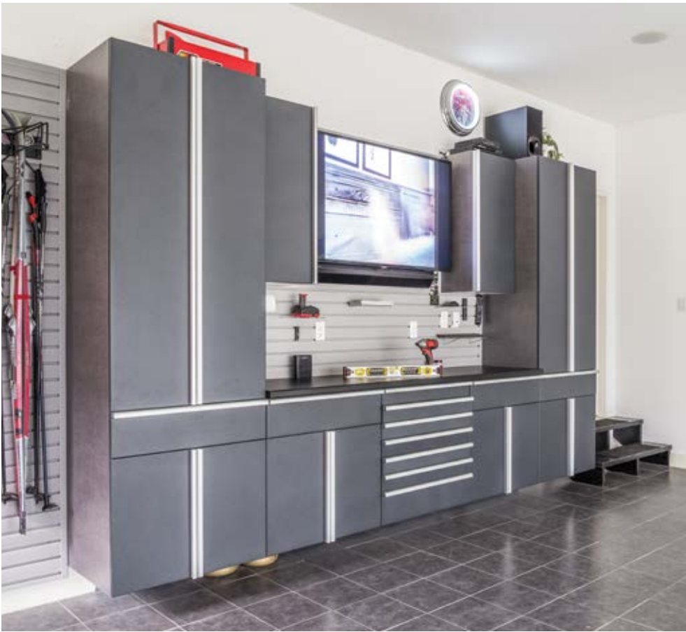
THIS PAGE: The customized garage storage system by Wilson Solutions, which houses a TV, is one of the home's hidden jewels. Customized cabinetry by Wilson Solutions is also found in the interior closets. OPPOSITE: Hidden storage is cleverly concealed by custom millwork around the fireplace.