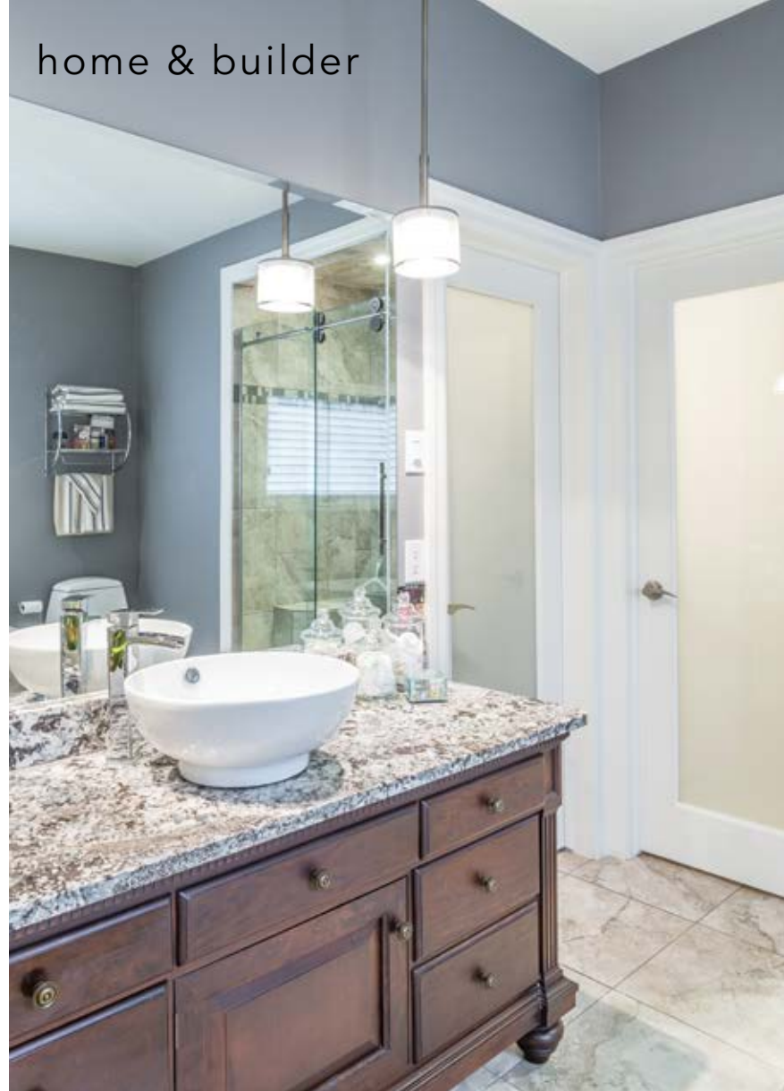
ABOVE, RIGHT: The principle en suite bathroom is decked out in bespoke cabinetry designed to match the bedroom furniture set. Frosted glass panel doors allow for privacy without losing natural light. TOP RIGHT: The principle bedroom showcases a stunning solid wood bed from local furniture maker Durham Furniture. Wall-to-wall windows treat the occupants to a river view.