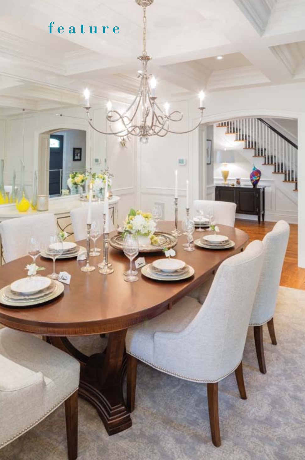
LEFT: The dramatic waffle ceiling and intricate wall mouldings create a beautiful backdrop for elegant evening entertaining. BELOW: The master bath is bright and fresh with large windows and water blue accents. BOTTOM: French doors in the master bedroom open to a beautiful view of the backyard. Soft fabrics create a tranquil space.