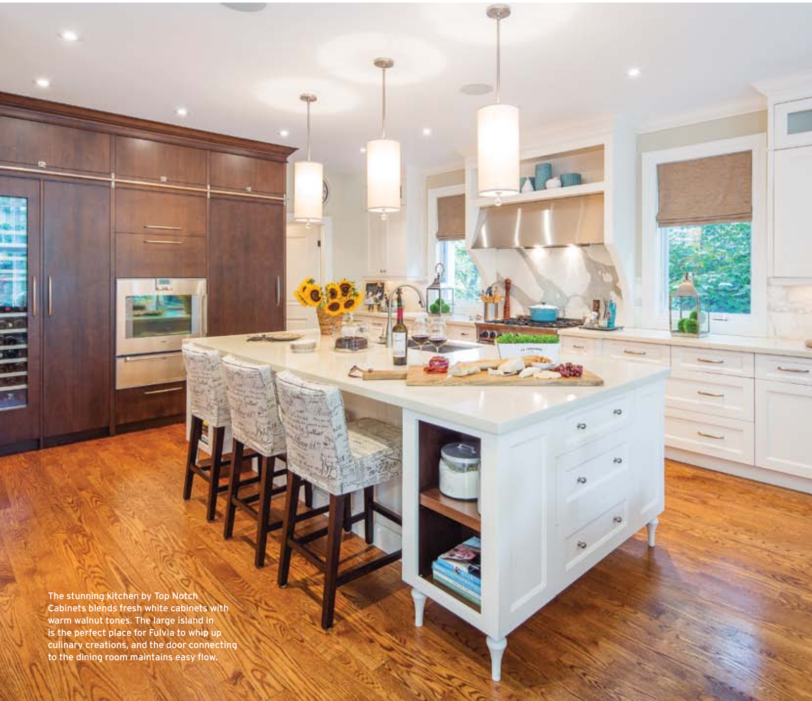
The stunning kitchen by Top Notch Cabinets blends fresh white cabinets with warm walnut tones. The large island in is the perfect place for Fulvia to whip up culinary creations, and the door connecting to the dining room maintains easy flow.

In the new kitchen, the couple wanted a space for optimum workflow and fluid entertaining. With a great reputation, Oakville's Top Notch Cabinets was a perfect fit for the reno. "Fulvia is a serious cook who would one day like to host a children's cooking school in-house, so a durable, low-maintenance design was essential," said Tracy. Two windows frame the cooking area and bring symmetry and light. The colour flecks in the white Italian Statuario marble backsplash by Stone Edge Marble and Granite are picked up in the beige striations of the creamy Buttermilk Caesarstone island top.