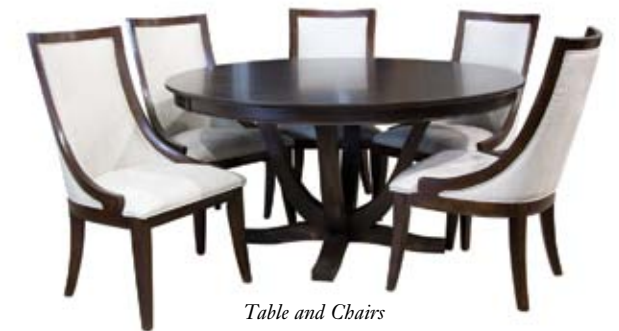
Table and Chairs

HEARTY Specializing in custom designs, builds, and finishes