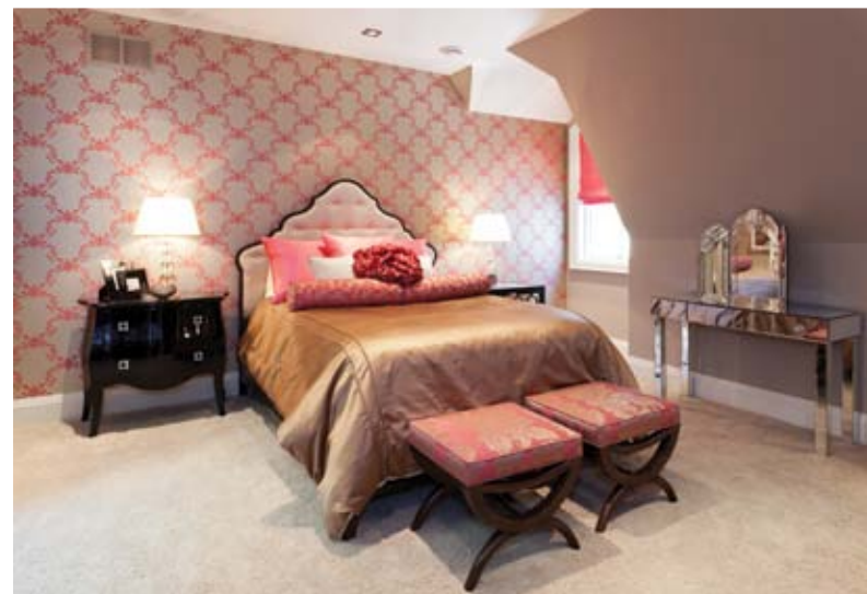
ABOVE LEFT: Cool, muted colours in the master bedroom create an atmosphere of Zen-like, soothing tranquility. ABOVE RIGHT: The spa-like appeal continues in the master bath where rich dark wood mixes with crisp white elements. RIGHT: Dazzling pink accents and dramatic wallpaper sprinkle this bedroom with Hollywood glamour.

Just off the great room is the couple's stunning bedroom retreat, a lovely space that is Karen's favourite room in the house. Vaulted ceilings and soft blue and white walls lend a quiet serenity to the bedroom. Two sets of double French doors, by Kolbe Gallery , flank a marble-clad fireplace and open onto a private patio with heated floors.