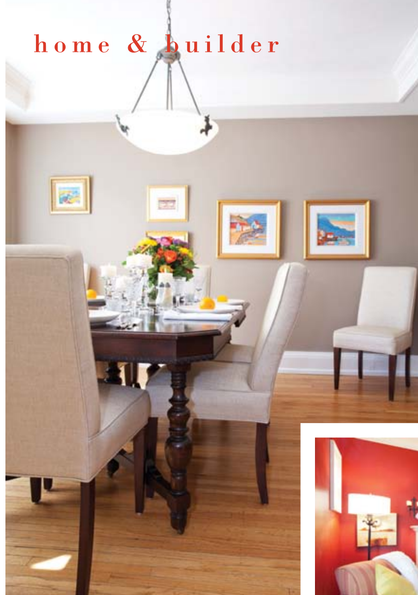
ABOVE: The dining room's eclectic mix of old and new elements creates a warm and intimate backdrop for a host of special occasions. TOP RIGHT: The gleaming honey-coloured front door is a welcoming glimpse of the warmth and relaxed allure that pulls guests into the rest of the home. BOTTOM RIGHT: Unique pieces of art leap from the rich red walls in the living room.