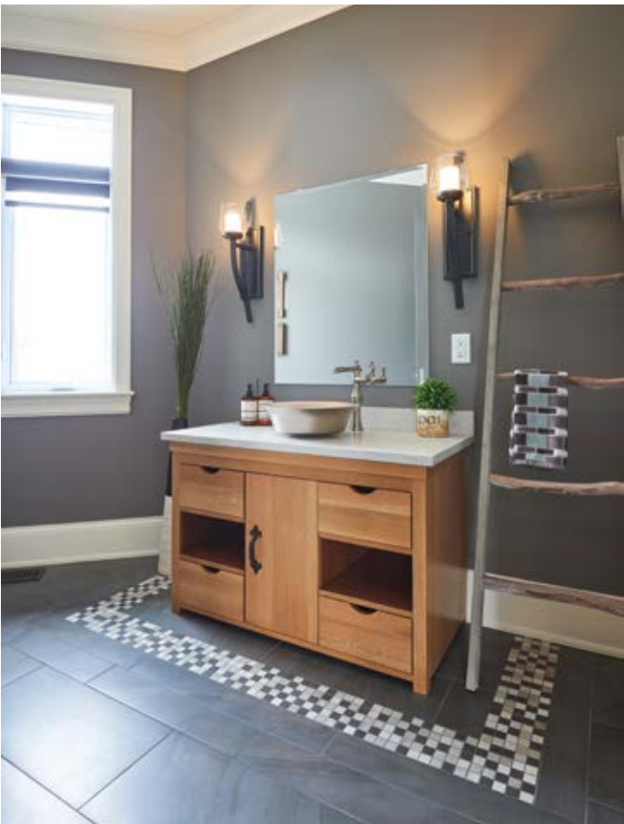
ABOVE: The living area overlooks the lake through large glass windows. TOP RIGHT: The powder room adds a touch of luxury. RIGHT: The laundry room is perfectly outfitted to help with the family’s needs.