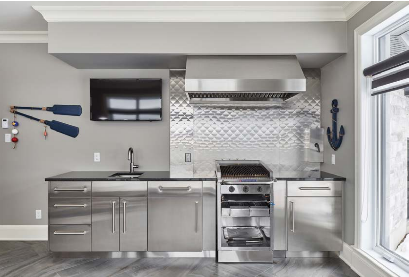
ABOVE: The couple opted for an indoor grill in their sunroom similar to what restaurants use so they could achieve those authentic grill flavours all year-round. RIGHT: The spacious open-concept main floor houses the staircase leading to the basement.

sleek built-in bench in the entryway and smart built-in shelving in the great room (millwork by House of Fine Carpentry and designed by Sheridan Interiors) show how the design details stack on top of each other for eye-popping effect. One of the most interesting details is the coffered ceiling (House of Fine Carpentry) in the main living area, which Paul and Celine used to create the sense of extra height and visual texture, by angling the ceiling and brushing the top portion with colour for contrast. The open floor plan spreads out through the dining room, large kitchen (House of Fine Carpentry) and a sunny great room. The layout was meant to get “as much river view as possible,” according to Celine, and makes total use of the abundant natural light that floods the space. The colour palette throughout hints of greys and soft blues that draw and disperse warmth. The rich hardwood flooring ( Tapis Richard Ranger Carpet Inc. ) throughout much of the house plays a key supportive role in tying the thematic threads of style together.