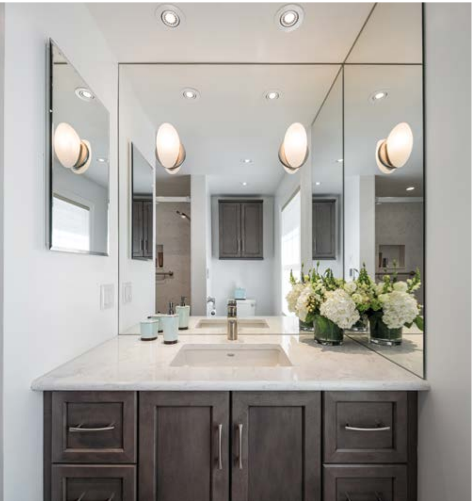
The bright, airy bathroom is complete with a sheet of granite, personalised towels and a mirror surround.