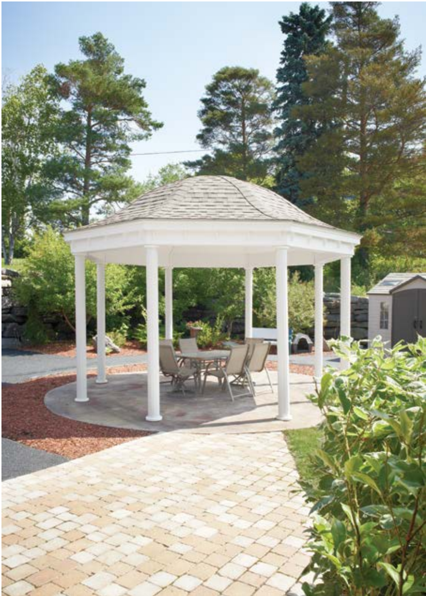
ABOVE: The beautifully landscaped gardens are complete with an orchestra pit above the flowing waterfall. TOP RIGHT: The gazebo is a place to relax in the shade close to the home. RIGHT: The English garden coming into bloom surrounded by luscious green lawn.

with the home’s architecture in mind. The formal dining room’s 12-foot dark oak table is perfect for entertaining large dinner parties with its accompanying high-backed ornate chairs; all exquisite 18th century Canadiana masterpieces found at Kondruss Galleries . They remind Emma of her great grandmother’s Danish furniture. Emma credits her mother for her love of antique furniture and good sense of balance when it comes to colour and design. Inheriting and cherishing special family heirlooms and furniture from her ancestors, like her mother did, inspired Emma to continue the tradition. Emma also praises Les for his sense of design. “The older I get the more I appreciate the workmanship that went into building something beautiful, that also lasts,” says Les. “We see antiques as having untold stories yet to be discovered and we’re having a lot of fun making those discoveries together.” Emma describes their home as a perfect combination of light, space, flow and elegance. We couldn’t agree more. OH