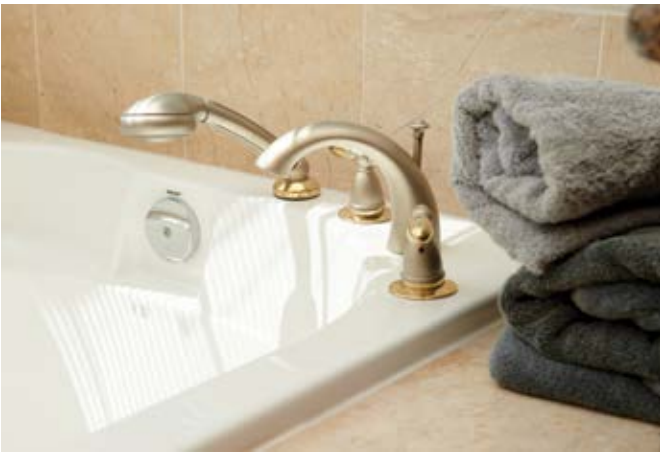
TOP: The sitting nook in the master bedroom is a great place to enjoy a coffee and look out over the gardens. The couple's dog, Chester, enjoys a nap in his own bed in the room. RIGHT: The bath is complete with a jet tub.