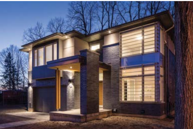
TOP: Double sinks and a waterfall shower complete this bathroom. RIGHT: The mudroom leading from the garage is conveniently next to a smaller shower room. ABOVE: This R-2000 home has a maintenance-free exterior.

48 Northside Road, Nepean | 613.828.1515 www.paradisebathandkitchen.ca