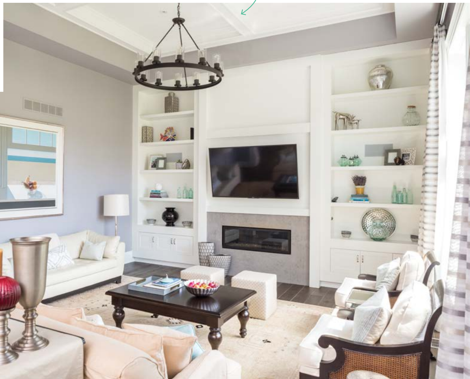
12 In the family room, the 14-foot ceiling and tall windows topped with elegant mullions add a grandness to the room that the homeowners love. Continued on page 46