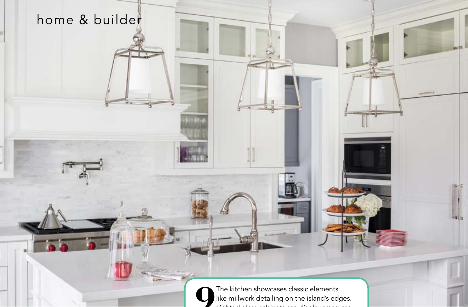
9 The kitchen showcases classic elements like millwork detailing on the island's edges. Lighted glass cabinets can display treasures while appliances are hidden behind custom panelling.