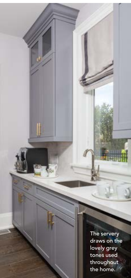
The servery draws on the lovely grey tones used throughout the home.