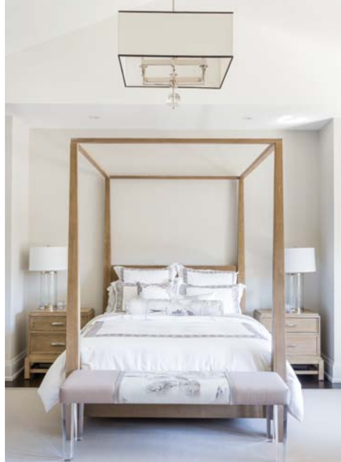
ABOVE: A tranquil colour palette and canopy bed make the master bedroom a serene retreat. TOP LEFT: The intricate diamond mosaic pattern in the flooring is reflected in the mirrored face of the tub. A spectacular full-height bookcase above the tub is integrated on a wall between the water closet and shower. BOTTOM LEFT: The mirrored his-and-hers vanities and waterfall marble countertops add sleek sophistication.

One of the elegant touches is a two-storey library. “I have a library like this one in my own house,” says Brian. “It’s nice to vary ceiling heights to break up the volumes.” Opposite the library is a serene living room with silver-leaf, mirror-topped tables that “add real sparkle.” Brian is also proud of the breakfast room with its enormous, plate-glass window. “I love looking down the main hall into the garden with that unobstructed view. I think that’s really a wow feature.”