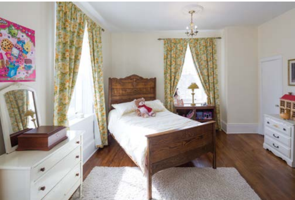
TOP LEFT: Original wooden flooring was preserved during restoration of the master bedroom where wainscoting and big windows create a light-filled alcove. TOP RIGHT: The master bedroom's walk-through closet leads to a modern en suite bathroom with glass-walled shower, ceramic flooring and marble-topped vanity. BELOW: Floral drapes and white furniture surround the sleeping space in Hannah's bedroom.

grand room," Mark says. An elaborately carved mantel surrounds the gas fireplace. Wooden shutters shield the windows. The room's provenance is uncertain. It was either brought here or copied from a room in a Scottish castle visited by Judge J.D. Armour, a Supreme Court of Canada judge, who owned Lakehurst in the late 19th century. "At today's standards you couldn't replicate it because it would be just too expensive," says Mark.