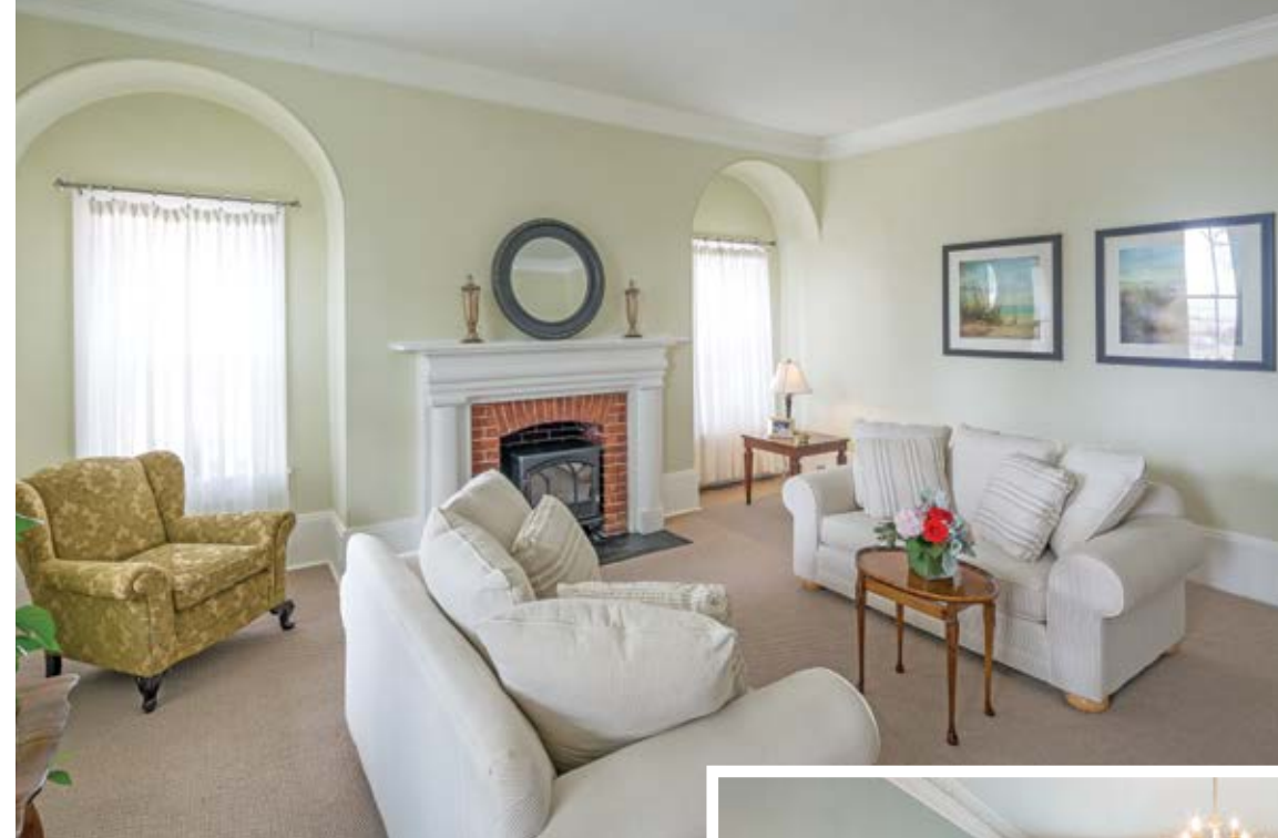
LEFT: The drawing room at the front of the home has side windows recessed in arched alcoves on either side of the electric fire. BELOW: New flooring was installed in the formal dining room where Heather made plaster castings to repair the acorn and oak leaf crown moulding that frames the ceiling. BOTTOM: Lakehurst’s main entrance was restored with trim to match the original woodwork. Wide hallways make it a spacious home.

up the yard, planting trees, shrubs and cedar hedges from Canadian Tire Garden Centre . They laid flagstones and installed pillars, iron gates and iron fencing. “We totally transformed the outside space,” Heather says. They restored a carriage house that was moved from another historic site to the rear of their property. They wired the entire house with high-performance Cat 6 cable for multi-media networking.