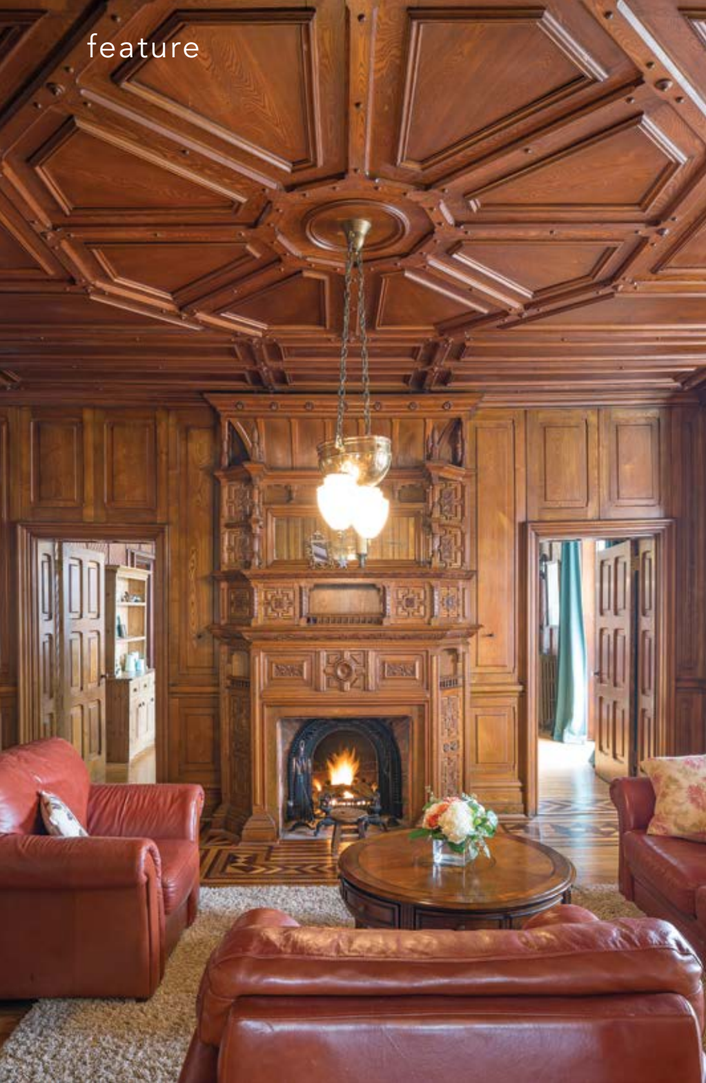
ABOVE: Red leather couches furnish the ornate great room, panelled in oak, ash and maple. An intricate pattern of inlaid hardwoods frames the floor. RIGHT: Mark and Heather Good furnished the home with antiques in keeping with its history.

wiring and plumbing, repointed and capped chimneys. They installed a new roof, fascia, soffit and eaves troughs. Wooden windows were removed, refurbished and new sash cords installed. Floors were refinished or replaced. “We renovated from top to bottom,” says Heather. “It was nice to work on a renovation with such history.”