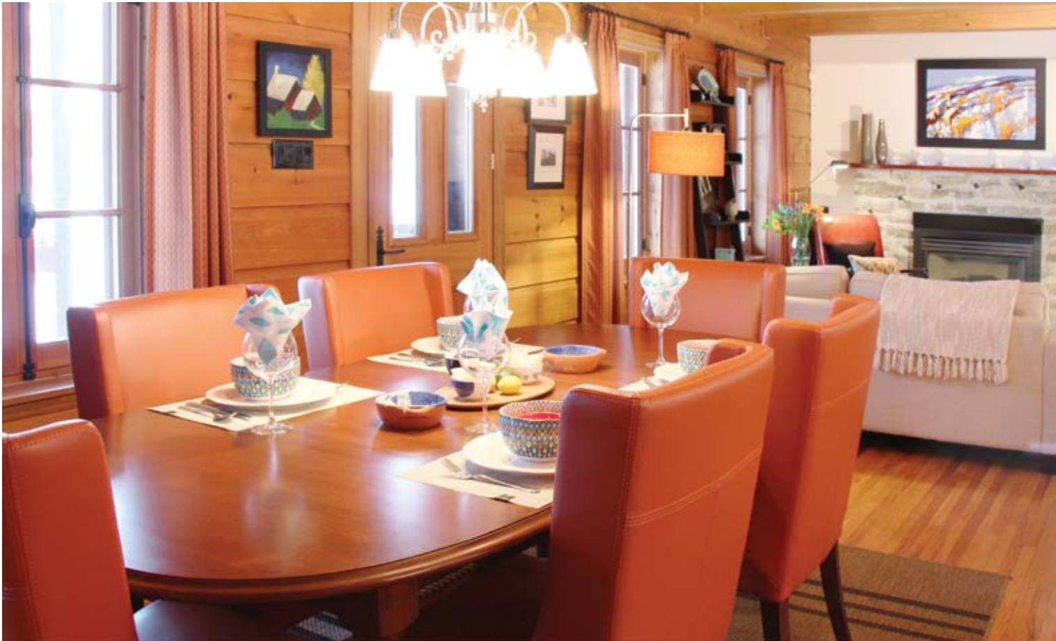
TOP: Sunlight streams through many large french windows, bouncing off the gleaming oak hardwood floors throughout the great room/dining room area. RIGHT: This large eat-in kitchen with storage space to spare features a granite counter, wall-mounted electric fireplace, maple cupboards, and a large window to let the sun shine in.