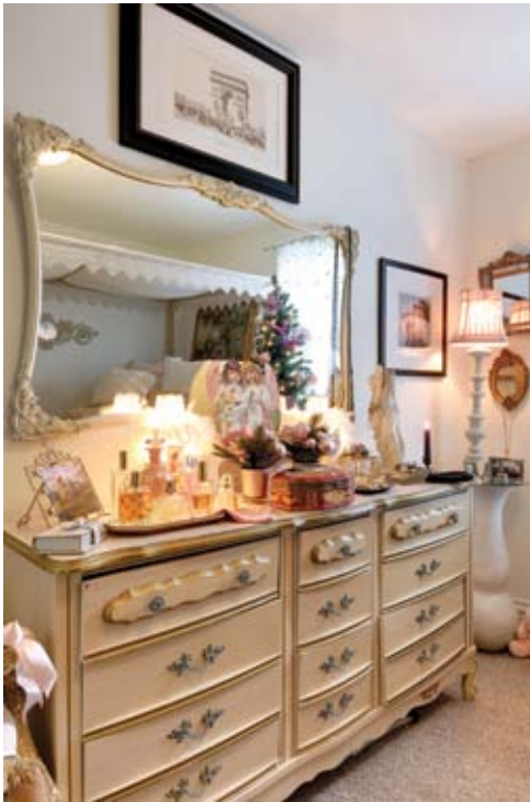
RIGHT AND BELOW: In the bedroom, a painted canopy bed is the focal point of a room filled with treasures, each infused with wonderful memories. BOTTOM: Shelves in the bathroom are filled with the best soaps and lotions, all available in Renée's Thornbury store, Pamper & Soothe.