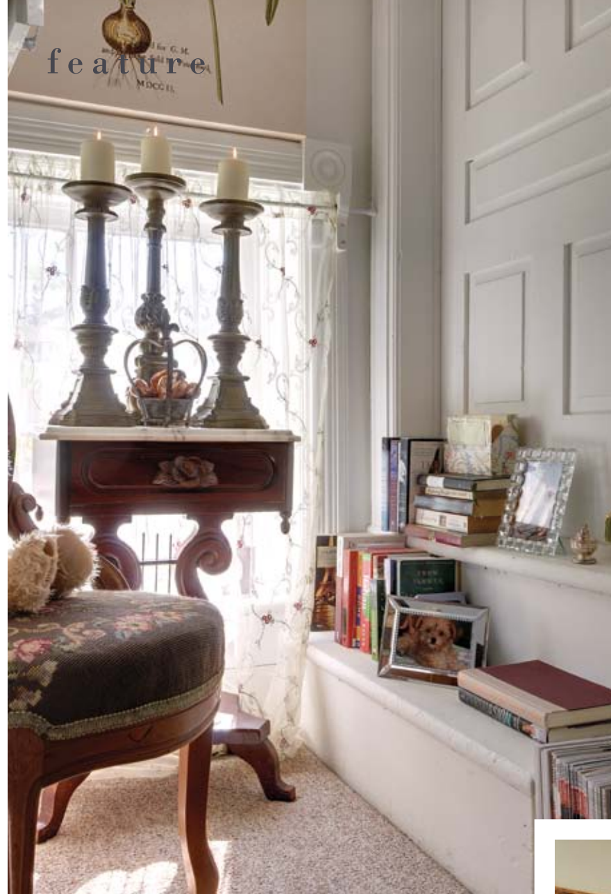
LEFT: Renée's reading nook. BELOW: The living room is decorated with Renée's favourite finds and reminiscent of a Paris apartment. BOTTOM: Renée's black and white living room is a charming mix of eclectic old-world gems. Fashion inspires the décor.