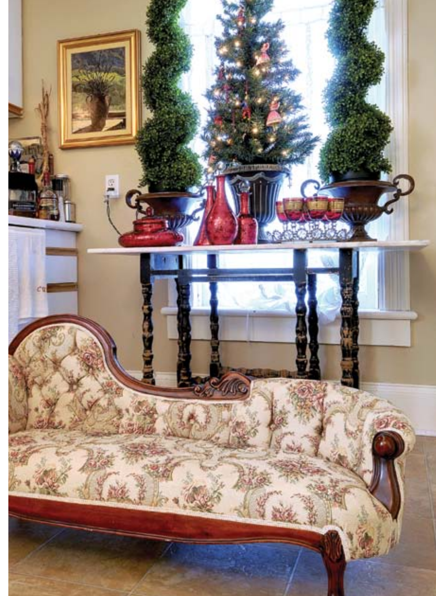
OPPOSITE: In the kitchen, a crystal chandelier hangs over a sparkling holiday vignette on an antiqued mirrored pedestal table. LEFT: Fabulous red serving pieces and accessories add to the festive feel in the kitchen. The settee is a perfect perch for Renée's beloved pets. BELOW: Renée downstairs in Pamper & Soothe.