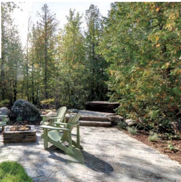
ABOVE: A path along the right side of the home leads to a backyard landscape by Oasis North that includes a covered barbecue hut, a firepit with seating, a hot tub and a deck. TOP RIGHT: The Bennett family, daughter Jill, Mom Lori, son Andrew and Dad Dave. RIGHT: Tall pine and cedar trees frame the beautifully landscaped and very private backyard. OPPOSITE TOP: Step down into the living room at the back of the house where a roaring fire warms the bright space and large windows bring the outside in. OPPOSITE BOTTOM: The sunroom off the great room was a must. A second wood-burning fireplace makes this room a favourite all year long.